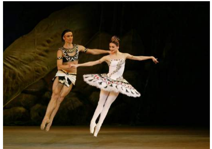
Sergei Filin as Lord Wilson. Svetlana Zakharova as Aspacia. La Fille du Pharaon.

October 27 – ballet dancer, National Artist of Russia Sergei Filin. 1988–2008 – Bolshoi Ballet soloist, 2011–2016 – artistic director of the Bolshoi Ballet, 2016–2019 – the head of the Youth Ballet Programme.