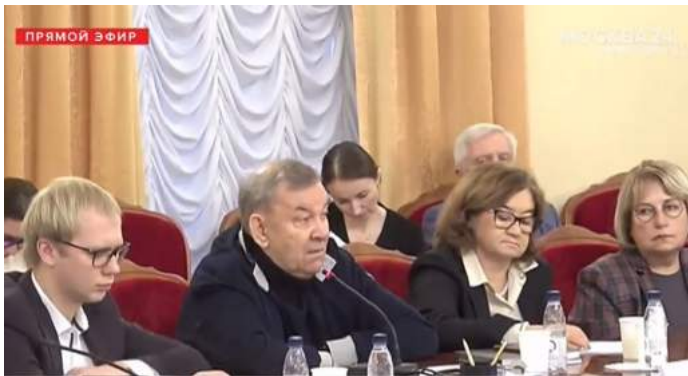
Vladimir Urin on Moskva24 TV channel

Moskva24 showed a report: "The Bolshoi General Director Vladimir Urin suggested that the State Duma simplify the procedure for purchasing pointe shoes abroad in the face of sanctions."