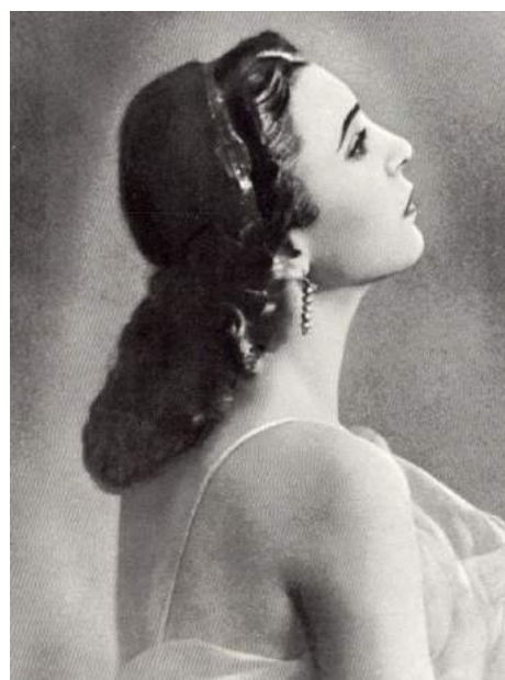
Raisa Struchkova in The Fountain of Bakhchisarai

October 5 – ballerina, ballet-master, National Artist of the USSR Raisa Struchkova (1925–2005)