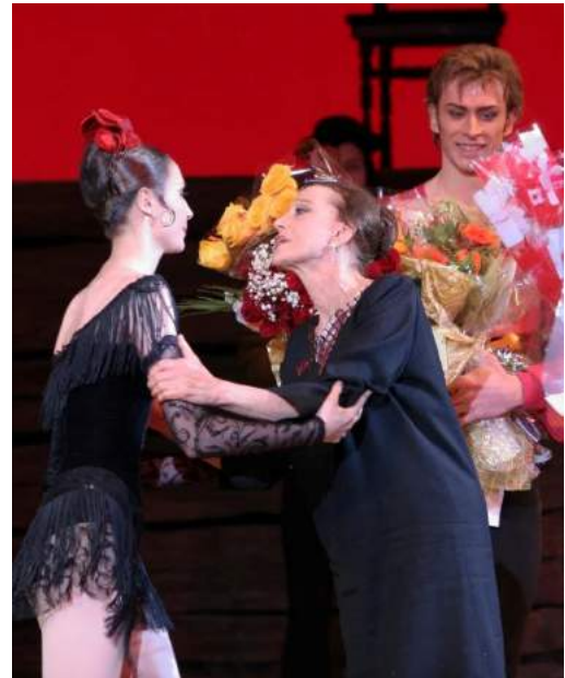
"Plisetskaya inscribed: 'Zakharova – Carmen'"

The online culture publication CultVitamin publishes an extensive interview with Svetlana Zakharova: