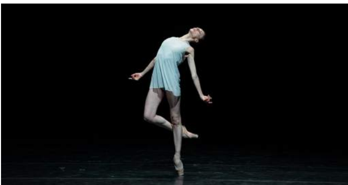
Svetlana Zakharova in Silentium.

On October 19, the Bolshoi Young Artists Opera Programme turned 13.