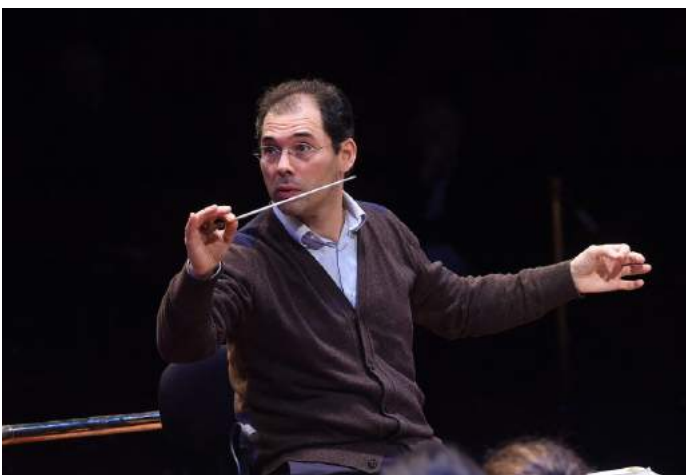
"Tugan Sokhiev – one of candidates for the position of the director of the Santa Cecilia Orchestra," – Corriere della Roma suggests