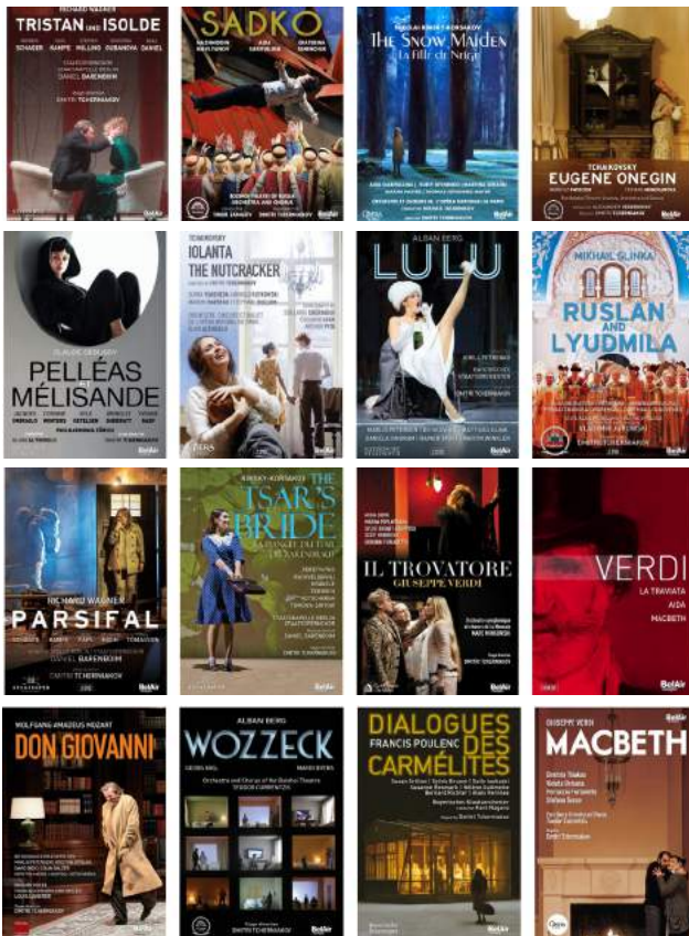
Dmitri Tcherniakov (DVD & Blu-ray) on BelAir Classiques