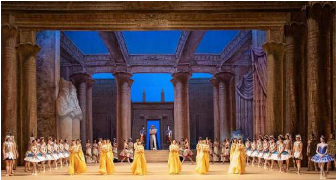
La Fille du Pharaon choreographed by Pierre Lacotte at the Historic Stage – October 20-23.

October 20, 21, 22, 23, the Historic Stage – the ballet La Fille du Pharaon to the music by Cesare Pugni. Choreographer – Pierre Lacotte – after the ballet of the same name by Marius Petipa.