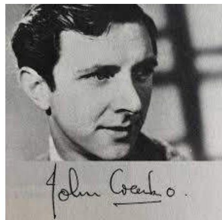
Choreographer John Cranko. For the 95th Anniversary