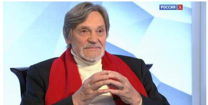
Vladimir Vasiliev on Kultura channel (October 18) – Anyuta Returns to the Bolshoi

The Main Role on Kultura channel – the National Artist of the USSR, an outstanding dancer and choreographer Vladimir Vasiliev talks about his ballet – Anyuta which is again on stage at the Bolshoi Theatre.