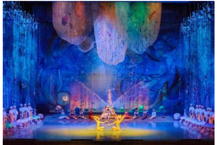
The ballet The Nutcracker by the Bolshoi Theatre of Belarus at the Bolshoi Historic Stage – October 28, 29.

October 28, 29 – two-act ballet The Nutcracker by Tchaikovsky, libretto based on the one by Marius Petipa, choreography and staging by National Artist of the USSR Valentin Elizariiev.