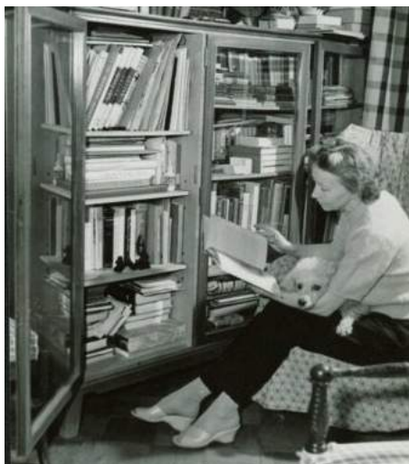
Galina Ulanova with her beloved poodle Bolshik.

Galina Ulanova's personal archive and flat were donated to the museum in the late 90s. In the memorial part, the interior scene is preserved completely. In the living room, bedroom and study, you can see antique furniture, works of art by Alexander Benois and Marc Chagall.