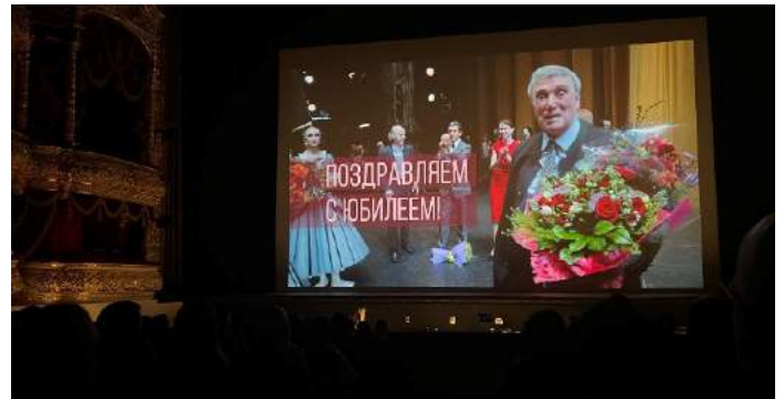
The Bolshoi Theatre dedicated the performance of La Fille du Pharaon on April 30, 2022, to the French choreographer's 90th birthday. Photo by Katerina Novikova from the Historic Stage.

A Dream from the Past – about the production