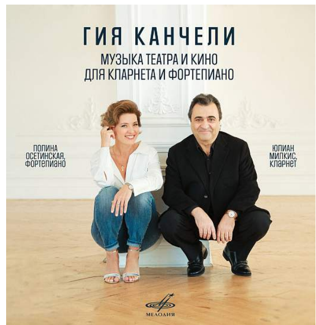
Melodiya publishes a studio recording of Giya Kancheli's works.