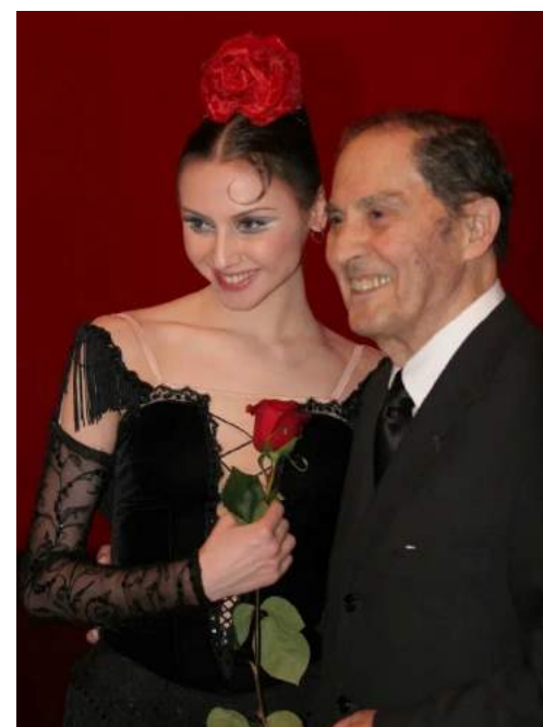
Svetlana Zakharova with Alberto Alonso.

"Let me start by saying that the ballet is really legendary. Today, it may seem to us, modern people, that there is nothing unusual in it, that everything there is quite modest and chaste in comparison with many modern performances. But in the last century, Carmen Suite was a real breakthrough! Maya Plisetskaya was an innovator in ballet, she was always looking for new directions. Her famous husband, Rodion Shchedrin, wrote music especially for her so that she