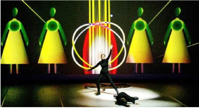
A number to music by Shostakovich with variations on the theme of Malevich within the Digital Opera Festival.

The 4th International Festival Digital Opera has finished at the Hermitage Theatre. This year, the topic of the competition task was Peter I's Paradise. Flood. Details – Saint-Petersburg Vedomosti /.../ "The final point of the show was a number to music by Shostakovich with variations on the theme of Malevich (photo.) /.../ The almost sculptural density of the 3D figures pulled the audience into a stream of metamorphosis."