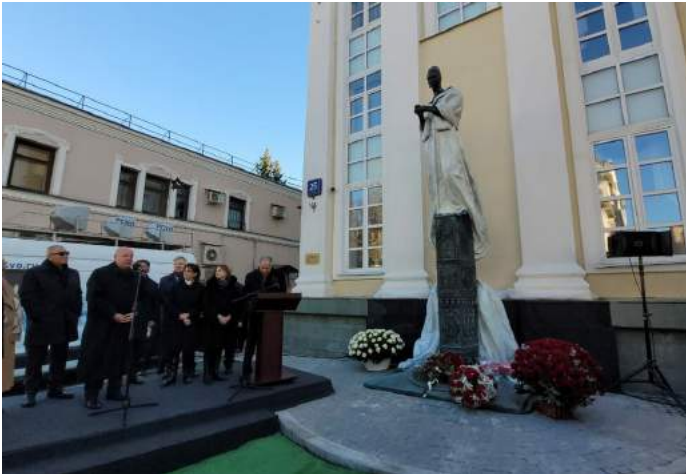
Unveiling of the monument to National Artist of the USSR Galina Vishnevskaya, October 25, Ostozhenka St, 25.