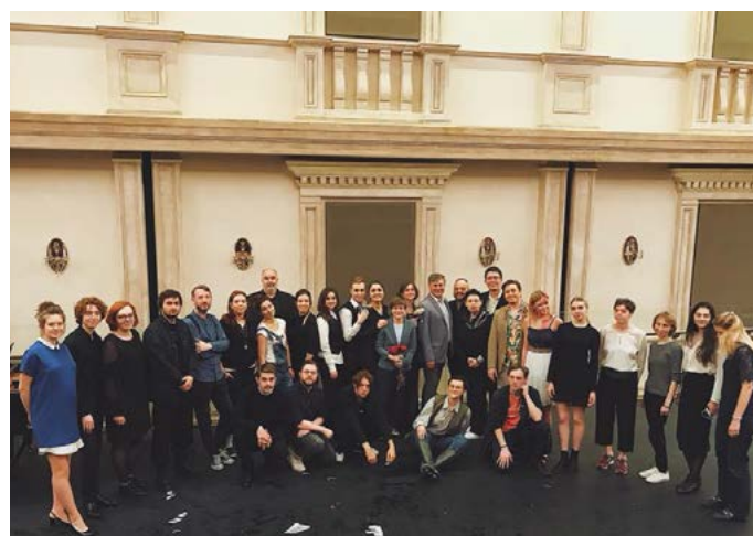
After the Bolshoi Theatre Young Artists Opera Program Concert Cantatas lab. Scenic Studies. Beethoven Hall, May 23rd.

May 23rd and 25th, the Beethoven Hall – the Bolshoi Theatre Young Artists Opera Program Concert Cantatas lab. Scenic Studies . The programme includes six short stories based on cantatas by Tomazo Albinioni, Antonio Vivaldi, Georg Friedrich Handel, Thomas Arne, Josef Haydn and Gioachino Rossini.