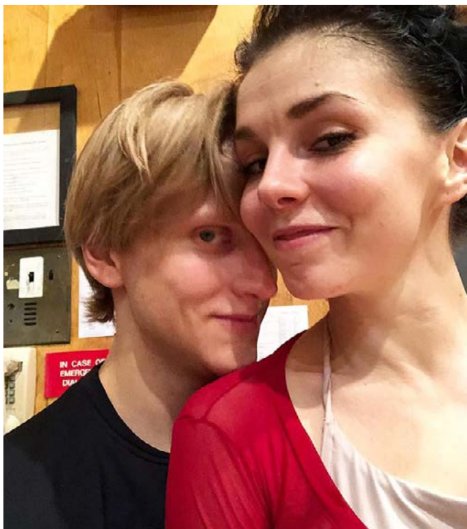
David Hallberg on Instagram (May 18th): “Birthday boy. Birthday girl. The birthday of Giselle. I love you, Natasha”, – with Natalia Osipova before performing in Giselle by ABT at the Metropolitan Opera

Olga Smirnova writes in her Instagram : “It was a real present from John Neumeier – I got a chance to spend two weeks with the Hamburg Ballet! Thank you so much! Now I want to live in this dream again”.