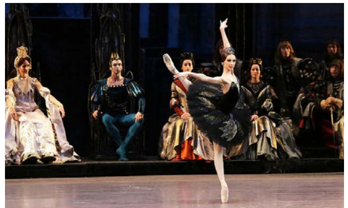
The announcement about Swan Lake (France 3, May 27th, 00:25 CET) on Culturebox

Swan Lake in the TV programme Télé-Loisirs Online-broadcast France 3