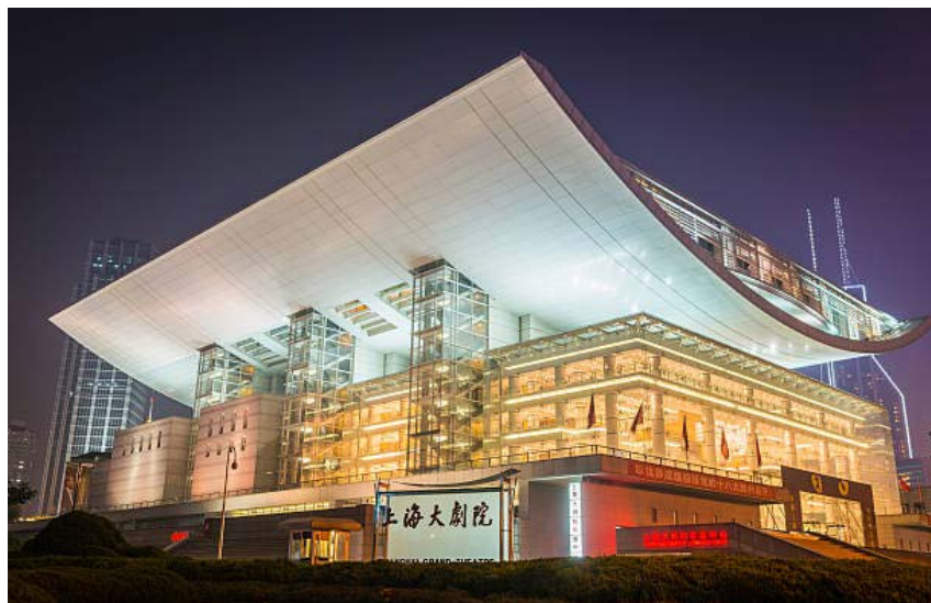
On May 14th – 16th the Bolshoi Theatre presented the opera The Tsar's Bride by Nikolay Rimsky-Korsakov at the Shanghai Grand Theatre (architect — Jean-Marie Charpentier, 1998)

The Chinese audience is always interested in seeing performances of the Bolshoi Theatre; in previous years the leaders of the PRC Mao Zedong and Jiang Zemin attended several shows. In March 2006, the opera and ballet artists, as well as the Bolshoi Theatre Orchestra, gave two concerts in honour of the opening of the Year of Russia in China. Celebrations took place in the main hall of the Great Hall of People, which has 10,000 seats, and