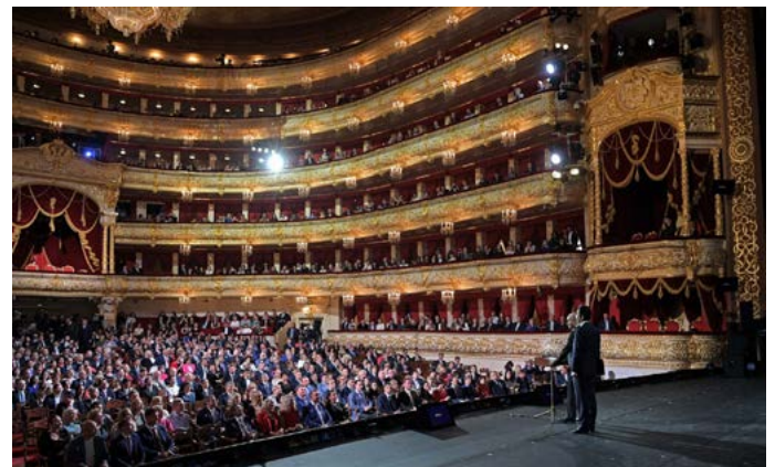
Vladimir Putin and Shinzo Abe got on stage to open the cross-cultural year of Russia and Japan. The Bolshoi Theatre, May 26th.

They got on stage to open the cross-cultural year of Russia and Japan, which featured an impressive display by men dressed as fully-armoured Japanese samurais.