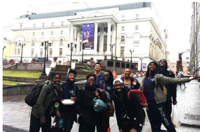
Dayton Dance Company in front of the Bolshoi Theatre New Stage building. Moscow, May 20th.

The critic appreciates the numbers of the tour program, but at the same time states: “And yet we must admit that the skills this company possesses are more impressive than the plastique material it performs. Creative message, virtuoso technique, crazy energy, excitement of dancers – in my opinion, all of these require yet another choreography, that is, the one that is more imaginative, more expressive and more inventive.”