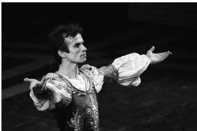
The photo on the playbill of the concert. Rudolph Nureyev as Romeo, December 20th 1980.

On May 31st and June 1st Svetlana Zakharova is going to take part in the Gala-concert of world ballet stars marking the 200th anniversary of Marius Petipa.