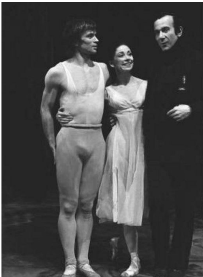
Rudolph Nureyev, Margot Fonteyn and Roland Petit, London, 1969

May 18th — David Hallberg, the Bolshoi Ballet's principal 2011-2014