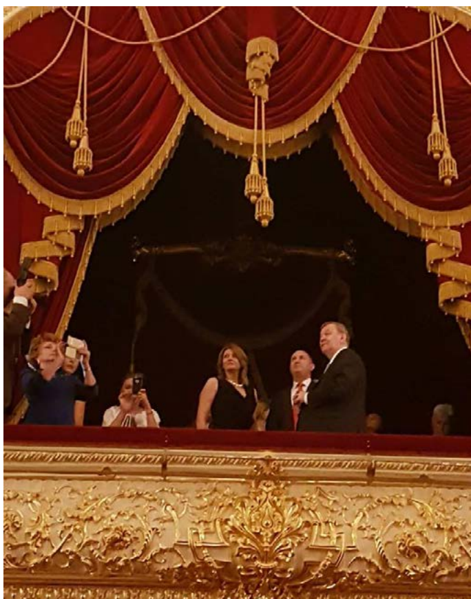
The President of the Republic of Bulgaria Rumen Radev with his spouse and the Bolshoi Theatre General Director in the box during the performance of Siegfried by the Bulgarian National Opera and Ballet Theatre. The Bolshoi Theatre, May 21st.