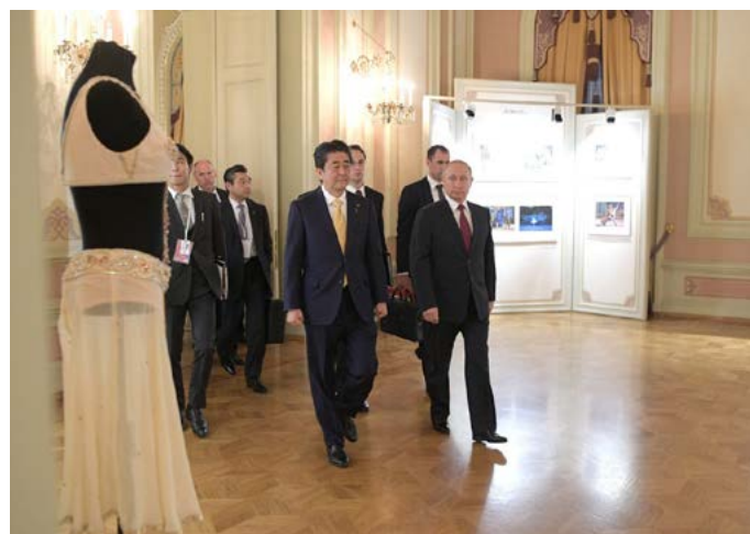
The Prime Minister of Japan Shinzō Abe and the President of Russia Vladimir Putin in the Historical Stage Foyer prior to the opening ceremony of Russia-Japan bilateral year. The Bolshoi Theatre, May 26th.