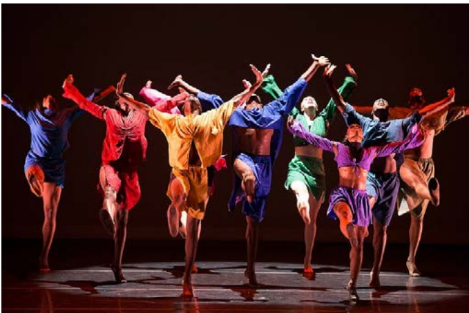
On May 19th and 20th the guest performances of Dayton Contemporary Dance Company (USA) took place on the New Stage.

ny (USA) marking the 50th anniversary of the Company took place on the New Stage.