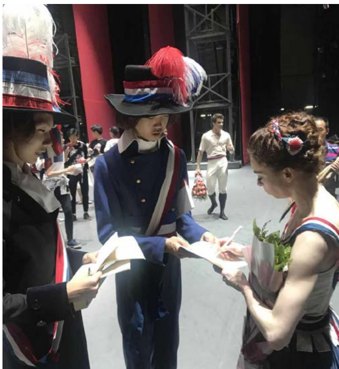
After the performance of The Flames of Paris at the National Performing Arts Centre in Beijing, May 24th.

Playbills for the ballets Le Corsaire and The Flames of Paris on the website of the National Centre for Performing Arts (in Chinese).