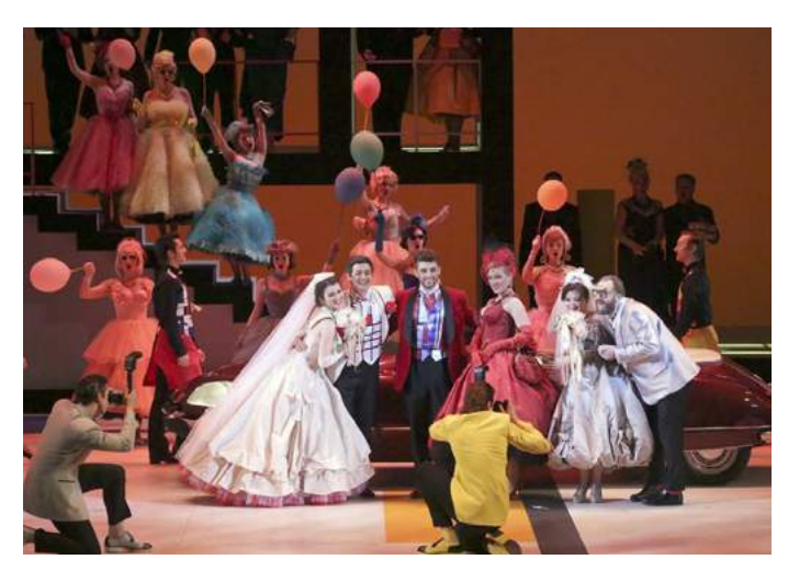
Le Nozze di Figaro.

January 31st, February 1st, 2nd, 3rd and 4th (at 2 p.m.) – the second block of performances of the opera Le Nozze di Figaro by Wolfgang Amadeus Mozart, staged by Evgeny Pisarev, took place on the New Stage. The production premiered on April 25th 2015. Le Nozze di Figaro was nominated for The Golden Mask Award in the category Oera/Best Production. The opera was last performed in September.