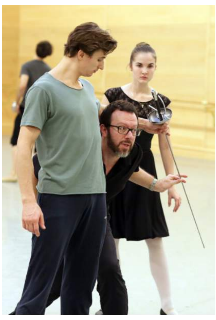
Alexei Ratmansky is rehearsing with the Bolshoi Theatre's dancers.