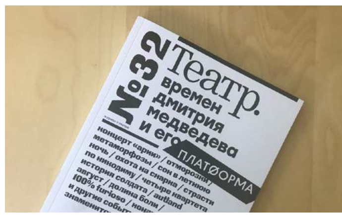
The January issue of Theatre magazine

The 32nd issue of the magazine Theatre was published in January. The whole issue is dedicated to the