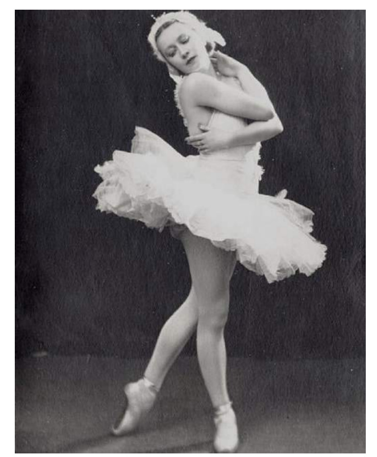
Galina Ulanova as Odette, Swan Lake.

"The first performance of Swan Lake took place in Moscow, at the Bolshoi Theatre on February 20, 1877. And today, 145 years later, it is hard to believe that at the beginning the fate of this most popular classical ballets was difficult and dramatic..." – <u>Music Seasons</u> tells the detailed history of the ballet's creation and its productions.