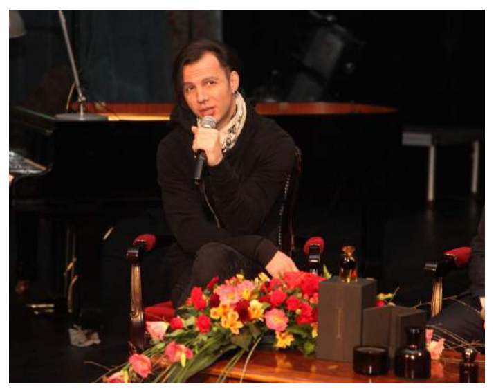
Teodor Currentzis at the presentation of his perfume (2017).

Hallberg In Conversation on the <u>Australian Ballet website</u> Australian dance magazine <u>Dance Australia</u>