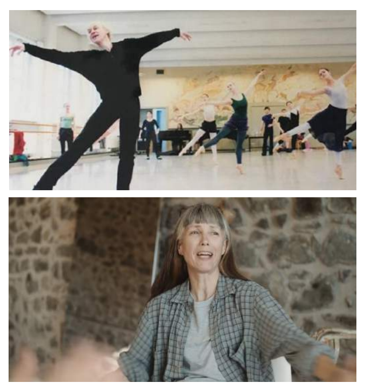
«Boris Akimov gives a master class at the Hamburg Ballet…» Sylvie Guillem – a documentary on <u>the DanceMasterclass website</u>.