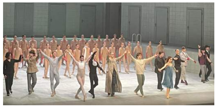
Master and Margarita. Curtain calls after the performance on February 17.