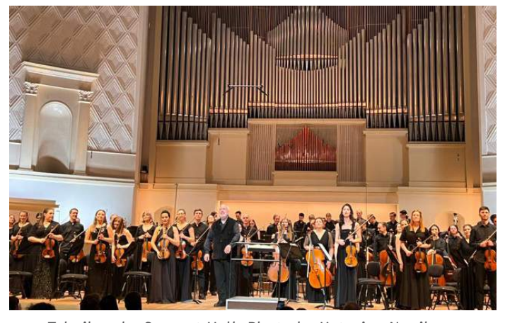
Tchaikovsky Concert Hall.

The day before, a concert of the musician and the orchestra took place in <u>Rakhmaninov Concert Hall</u>.