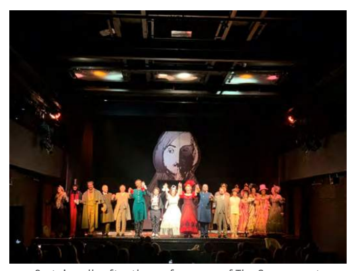
Curtain calls after the performance of The Government Inspector on November 2.

November 5, 6, 7 — <u>Adventures of Cipollino</u> by Tatiana Kamysheva, based on the namesake tale by Gianni Rodari