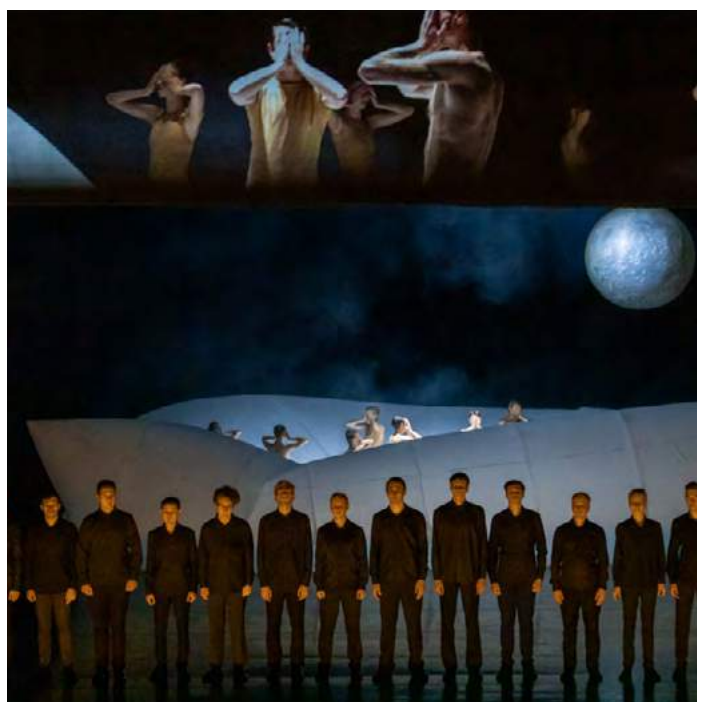
Anniversary performance dedicated to Leonid Desyatnikov - a ballet evening L.A.D. presented on November 4 at Bryantsev Youth Theatre

• The 12th International Art Festival Diaghilev started on November 4 at Bryantsev Youth Theatre with the L.A.D. programme. These are four choreographic opuses to music by Leonid Desyatnikov. The festival will continue with the evening of modern choreography Postscript performed by Bolshoi Theatre soloists. It includes miniatures by choreographers Wayne McGregor, Sidi Larbi Cherkaoui, Alexei Ratmansky, Sol Leon and Paul Lightfoot. The Diaghilev P.S. Festival programme includes Swan Lake staged by the French choreographer Angelin Preljocaj, the musical performance Diaghilev.The Last Days by Roman Gabria, the exhibition Five Temptations of Johann Faust, a performance by the AXE Theatre, and a ballet evening Dialogues.