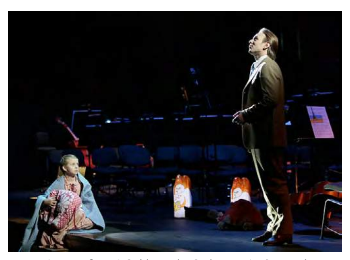
A scene from A Guide to the Orchestra. Le Carnaval des Animaux.

November 6, the New Stage — A Guide to the Orchestra. Le Carnaval des Animaux. A theatrical excursion into the world of the symphony orchestra, uniting The Young Person's Guide (Variations and Fugue on a Theme of Henry Purcell) by Britten and Zoological Fantasy by Saint-Saëns.