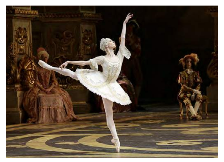
Olga Smirnova as Princess Aurora in The Sleeping Beauty.

November 6 - Olga Smirnova, Bolshoi Ballet prima - 30th birthday