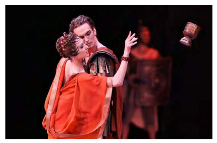
Svetlana Zakharova and Artemy Belyakov in Spartacus

• International online publications announce the screenings of Bolshoi Ballet live performances in cinemas across the world on November 7.