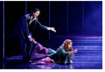
The premiere of the opera <u>Don Giovanni</u> – November 3-7, the New Stage. The Premiere cast photos via the link

• On November 3 – 7, the New Stage, the Bolshoi presented the premiere of the opera by Wolfgang Amadeus Mozart <u>Don Giovanni</u>.