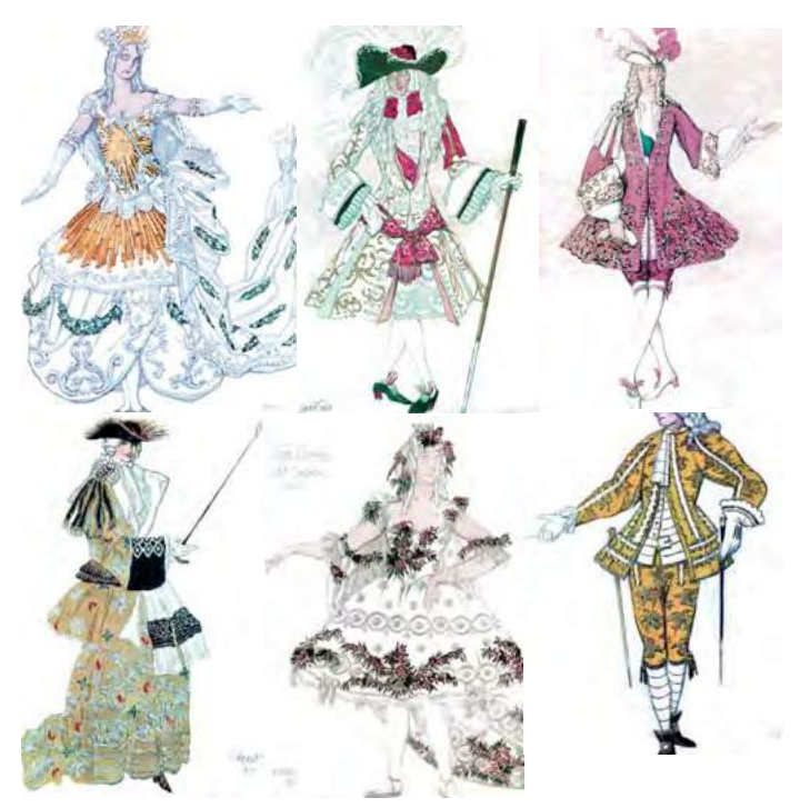
Leon Bakst's costume sketches for Princess Aurora and Prince Charming at their wedding, costume sketches for the Princess Pages, for the Baroness in the hunting scene, for the Cherry Blossom Fairy for the Canary Fairy's Page Boy.