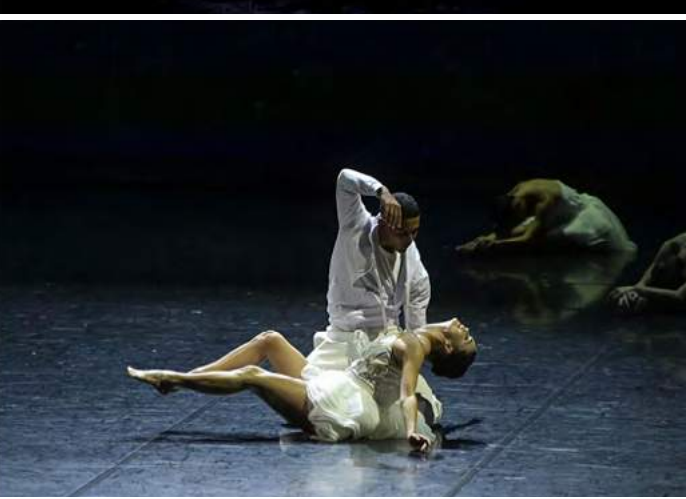
<u>Swan Lake</u> by Ballet Preljocaj (France) within the DanceInversion at the Bolshoi New Stage — November 16 and 17

• The Bolshoi Theatre <u>finishes the International Festival</u> <u>Dancelnversion</u> on November 17