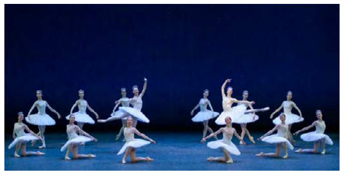
Emeralds to music by Gabriel Fauré - Rubies to music by Igor Stravinsky - Diamonds to music by Pyotr Tchaikovsky: Jewels by George Balanchine at the Historic Stage -November 9, 10, 11

• November 9, 10, 11 , the Historic Stage — <u>Jewels</u> by George Balanchine.