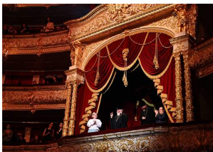
An all-Russian gala dedicated to the Day of Slavic Written Language and Culture took place at the Bolshoi Historic Stage on May 24