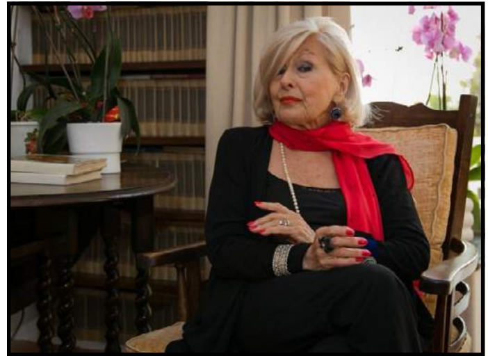
Violetta Prokhorova / Violet Alvin (photo of 2015) - November 3, 1924, Moscow - May 27, 2021, Vico Equense, Naples

Prokhorova moved to Italy with her second husband who was Italian and for some time performed at Teatro alla Scala. She also directed the ballet company of Teatro di San Carlo. In 1986, The Times called Alvin "Margot Fonteyn's only rival."