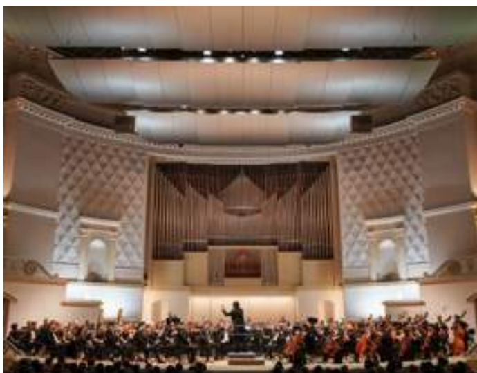
Lucas Debargue, Tugan Sokhiev and the Bolshoi Orchestra at Tchaikovsky Hall on May 18.

A Symphony Night took place at Tchaikovsky Concert Hall in Moscow on May 18. Lucas Debargue (piano) and Symphony Orchestra of Bolshoi Theatre of Russia , conductor — the Bolshoi music director and chief conductor Tugan Sokhiev - performed Concerto No. 1 for piano and orchestra in E-flat major by Ferenc Liszt and Symphony No. 6 in A minor ("Tragische") by Gustav Mahler.