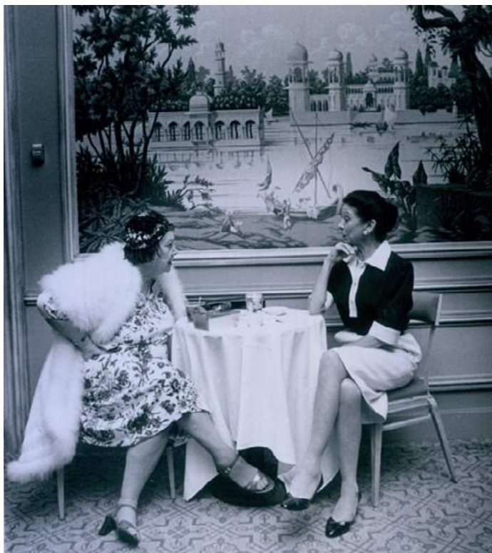
"Ballerinas Kyra Nijinsky (1914-1998) and Margot Fonteyn (1919-1881)", 1982 — "The first Dame of English ballet was born on May 18."