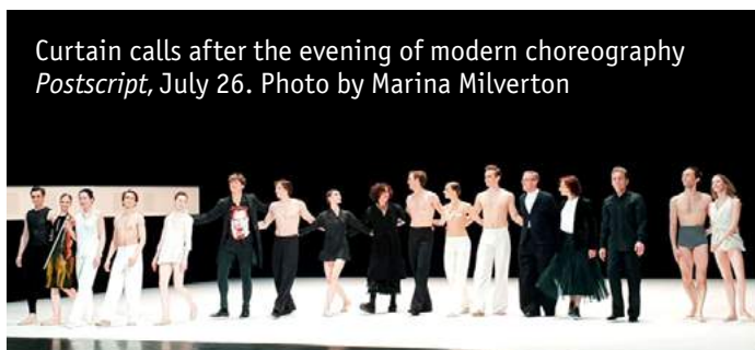
Curtain calls after the evening of modern choreography Postscript, July 26.

NTD2, music by Philip Glass. Violin – Anna Yanovskaya, piano – Alexei Melentiev.