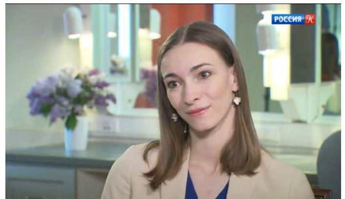
Ballerina Olga Smirnova - about the Postscript programme at the Bolshoi – Novosti Kultury with Vladislav Flyarkovsky