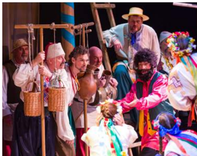
The Fair at Sorochyntsi by Mussorgsky, staged by Boris Pokrovsky, at the Chamber Stage — May 27- 29