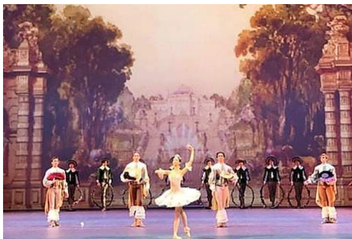
The Waltz and Adagio of Aurora and Foreign Princes from The Sleeping Beauty. The Historic Stage, May 27.

The academy graduation concert takes place annually at the Bolshoi Theatre. Graduates perform well-known