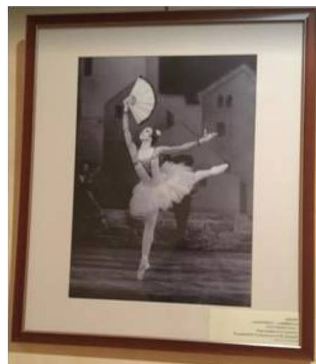
Exhibition dedicated to the 80th anniversary of the birth of the National Artist of the USSR Natalia Bessmertnova - at the Bolshoi New Stage.

The premiere of Boris Pokrovsky's production (1912-2009) took place at the Chamber Theatre on June 14, 2000.