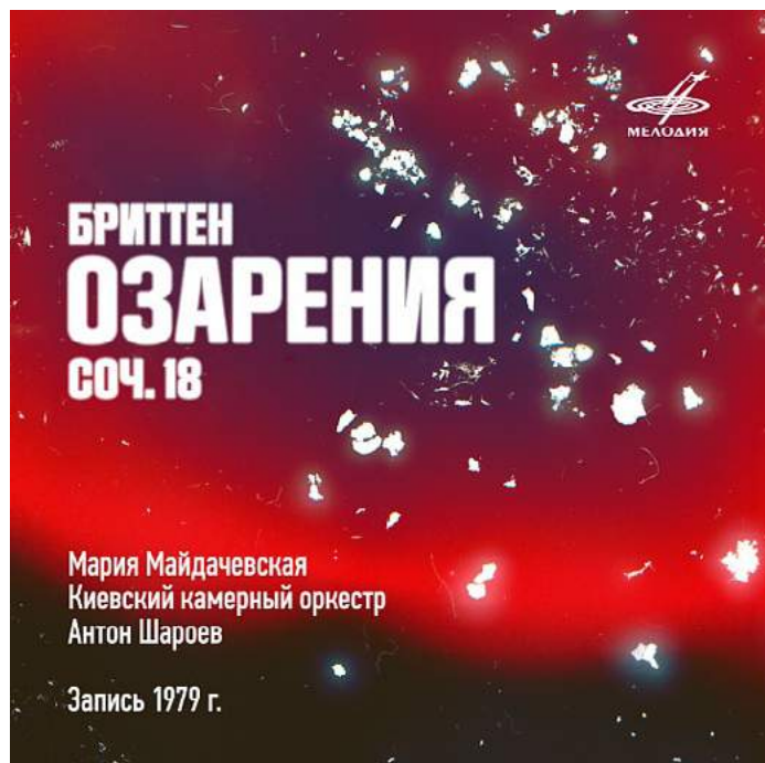
Benjamin Britten. Les Illuminations , recording: 1979