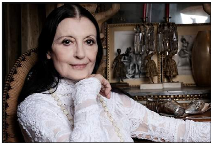
Carla Fracci (20 August 1936, Milan - 27 May 2021)

Outstanding ballerina Carla Fracci died on May 27 at the age of 84.