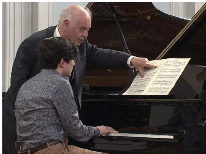
Pianist and Conductor Daniel Barenboim held a master-class for the students of the metropolitan conservatory.