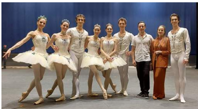
Dancers and tutors after the performance of the Symphony in C on May 23.

There were three performances of the ballets Etudes and Symphony in C within the programme Bolshoi for Youth . Having been put on sale on May 19, tickets were sold out in 24 hours at a special price of 800 rubles.