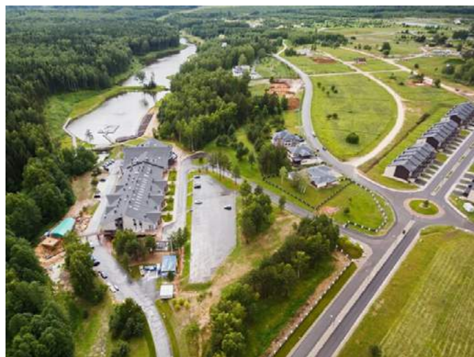
This year, the Bolshoi's traditional tour in Dobrograd will take place on July 3.

• The Bolshoi Theatre will resume its tour in Vladimir Region in July. The performance under the direction of the theatre's chief conductor and music director Tugan Sokhiev will take place on July 3 in Dobrograd. Orpheus Radio reports referring to TASS. The programme includes popular classical works. The concert will take place in an open area at a summer theatre located on a lake surrounded by a pine forest. The audience capacity is about 2.5 thousand people. This will be the company's third tour in the region. Last year the concert was cancelled due to the pandemic.