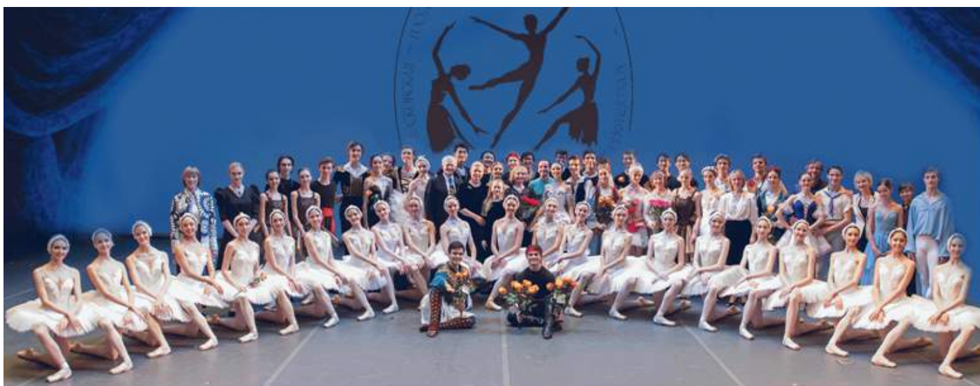
Moscow Ballet Academy presents its traditional graduation concert at the Bolshoi Historic Stage — May 27 and 31