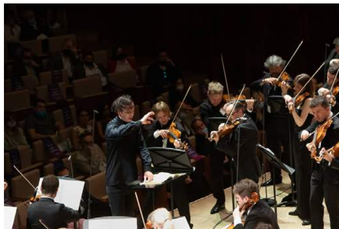
Teodor Currentzis and the musicAeterna orchestra turned the performance of Desyatnikov's Rite of Winter 1949 into a premiere.

• The Diaghilev Festival returns to its traditional format. The festival will open on June 10 with the concert The Rite of Winter 1949 by Leonid Desyatnikov, conducted by Teodor Currentzis, and will last 11 days. Besides the main events, there will be an educational programme and a festival club.