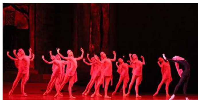
Maria Alexandrova as Mekhmene Banu, Vladislav Lantratov as Ferkhad — A Legend of Love by Arif Melikov, staged by Yuri Grigorovich, at the Historic Stage