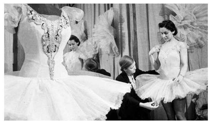
"The Bolshoi Theatre soloist Olga Lepeshinskaya in a fitting room of the Bolshoi, June 1944."

"On October 28, 1941, a bomb fell on the building of the Bolshoi Theatre. A shell weighing half a tonne passed between the columns under the gable of the portico, broke the front wall and exploded in the vestibule. The restoration of the building began in the winter of 1942. The experts completed their job in 240 days — in blackout conditions, without heating. In 1943, the company returned from evacuation in Kuibyshev (now Samara) to the already repaired building. Soon there were premieres of the operas lvan Susanin by Mikhail Glinka and Prince Igor by Alexander Borodin. The latter, about the famous campaign against the Polovtsians, was supposed to "reduce the number of operas with pessimistic plots in Moscow theatres."