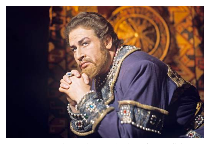
Evgeny Nesterenko as Prince Igor in Alexander Borodin's opera of the same name Prince Igor. The State Academic Bolshoi Theatre, 1981.

• <u>Rossiyskaya Gazeta</u> brings to the attention of its viewers The Last Interview with Evgeny Nesterenko.