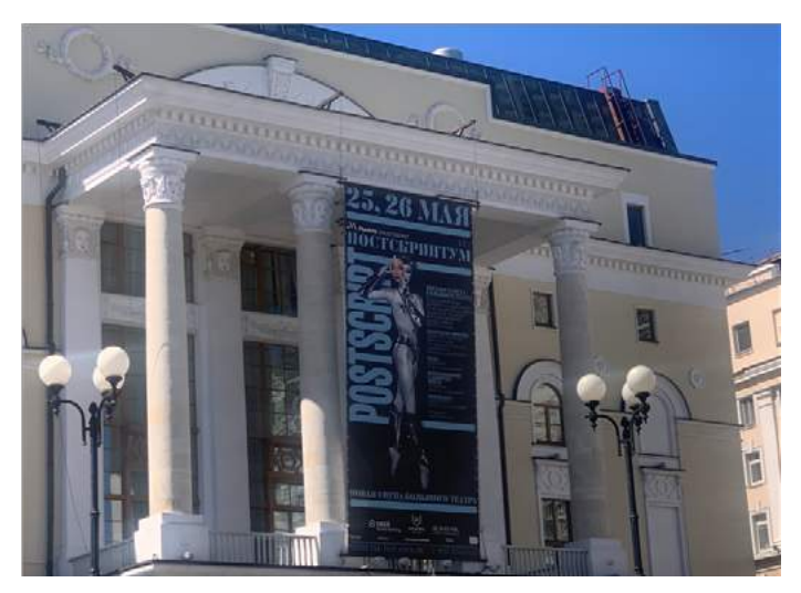
<u>Postscript</u> at the New Stage — May 25 and 26.