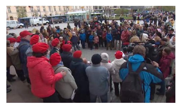
Ceremonial Tradition: How Russia Celebrated the Victory Day — a <u>video report</u> by Izvestia from the steps of the Bolshoi Theatre

• "The gloomy weather in the capital this year did not prevent us from celebrating May 9: Muscovites gave veterans red carnations, sang war songs and danced a waltz near the Bolshoi Theatre," <u>Izvestia</u> says. — ... The sounds of an accordion and a song near the theatre ... The atmosphere is so warm and soulful that no one is going to leave despite the chilly wind. The audience is waltzing to the song In The Front-Line Forest. "