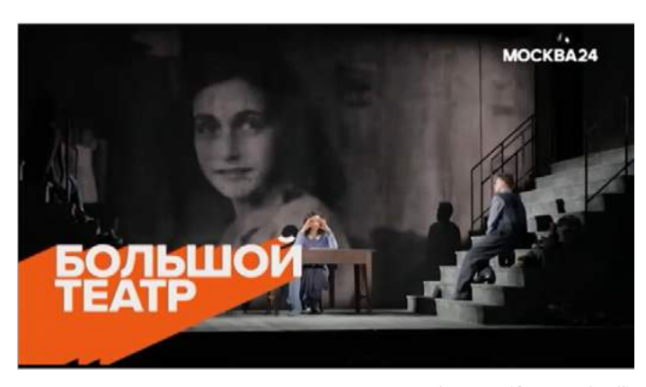
<u>Moskva 24</u> (from 13'28")

"The heroes of the operas are not fictional characters — they are real persons who never knew each other in their lives.