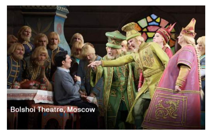
In May, the music TV channels Mezzo and Mezzo Live HD will show performances of the Bolshoi Theatre Boris Godunov, Sadko, The Sleeping Beauty, Marco Spada.

<u>Video</u> about the upcoming screenings — May with the Bolshoi Theatre and Mezzo!