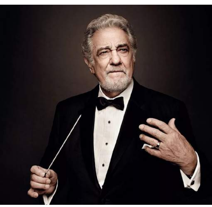
Maestro will conduct the opera La Bohème on February 12 and 14

On February 12 and 14 Placido Domingo will stand at the conductor's desk of the Bolshoi Theatre once again. Maestro will conduct the opera La Bohème by Puccini.