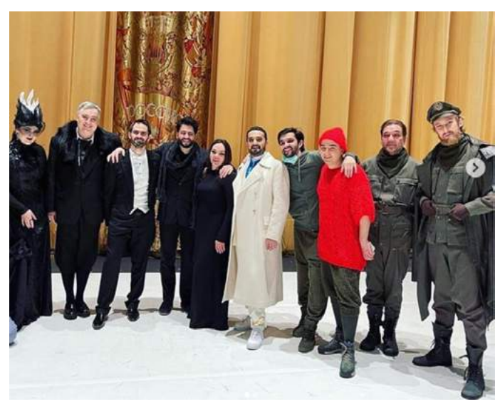
Performers and the conductor after the performance of January 27.

A video fragment of curtain calls on January 31 on the <u>Instagram</u> of maestro Giacomo Sagripanti.