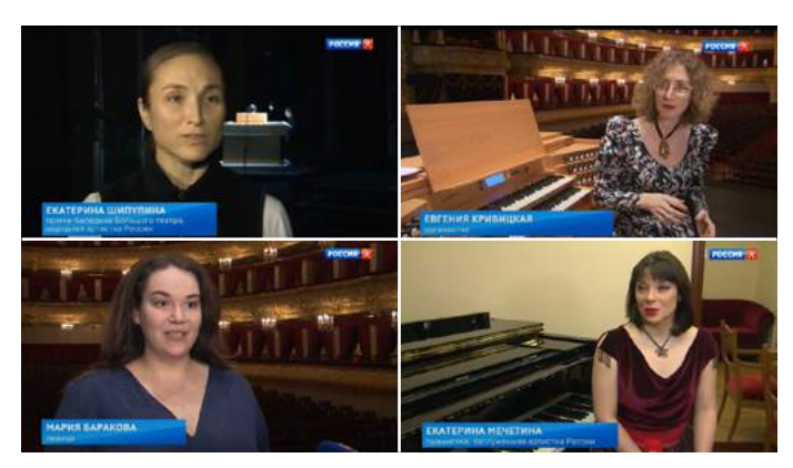
The Winter Rhapsody — an Organ Gala at the Bolshoi

Muzykalnaya Zhizn magazine: "The exclusive genre of organ gala has existed on the Bolshoi playbill since 2013 when the inauguration of a new organ, built by special order by the German company Glatter-Goetz, took place. Its design is unique: the audience does not see the organ pipes. They are hidden in a special gallery that rises 10 meters above the stage. The instrument has 31 registers