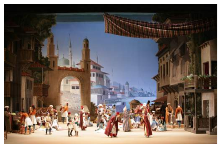
Marketplace. A scene from Le Corsaire.

the magic of a shipwreck on stage excites you more than the real thing in the film version of the Titanic, then have no doubt, you are a potential fan of this Le Corsaire."