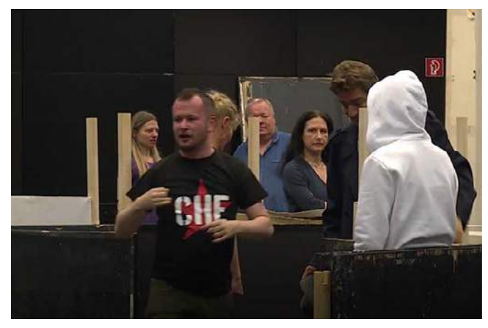
Dmitri Tcherniakov at a rehearsal of Der Freischütz at Bayerische Staatsoper; the online premiere of the production — February 13.

On February 13, on the website of the Bayerische Staatsoper (Munich), the online premiere of Carl Maria von Weber's opera Der Freischütz directed by Dmitri Tcherniakov. Then the performance will be available to online viewers for a month up until March 15.