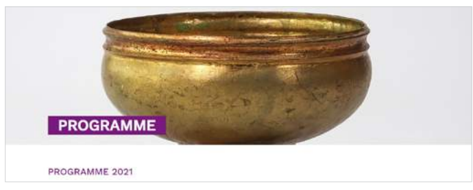
The Bayreuth Festival announced its programme for 2021

Numerous Russian and foreign media report the publishing of the programme of the 2021 Bayreuth Festival on January 29. In 2020, the festival was cancelled due to the coronavirus pandemic. The festival will open on July 25 with the premiere of <a href="Der Fliegende Holländer">Der Fliegende Holländer</a> in a new version by Russian director Dmitri Tcherniakov. The opera will be performed seven times.