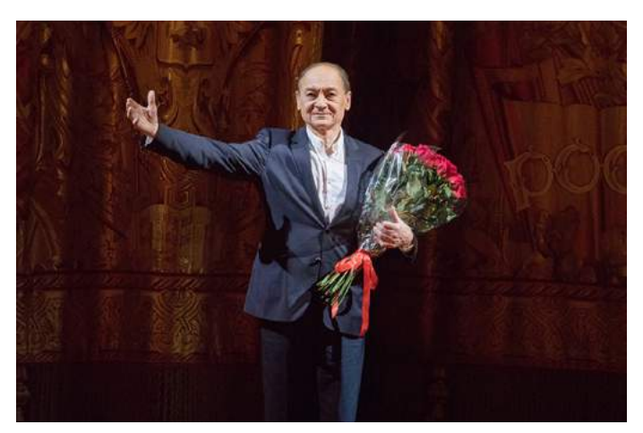
Mikhail Lavrovsky. Photo /Instagram

See more about the opera and the history of its productions at the Bolshoi