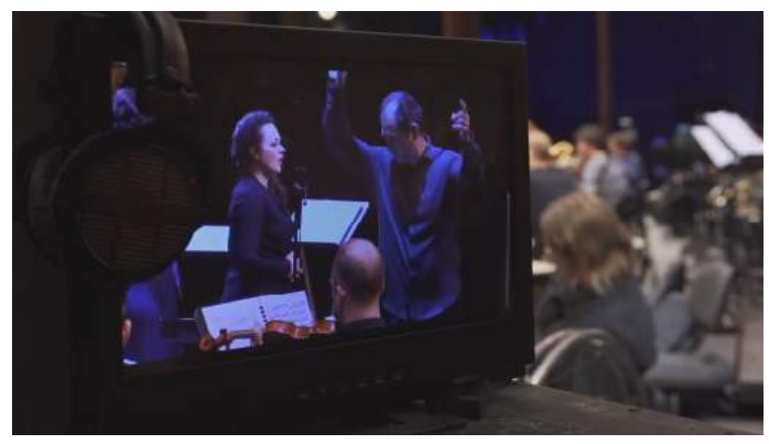
Rossia-Kultura channel showed the film Tchaikovsky. Genio Loci.

A premium version of the film will be available at the Bolshoi YouTube channel.