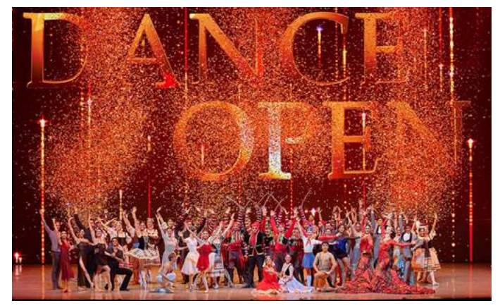
The ballet festival Dance Open finale with an international gala at Oktyabrsky Grand Concert Hall in St Petersburg

production with fresh and easy optimism hardly expected in our dark times."