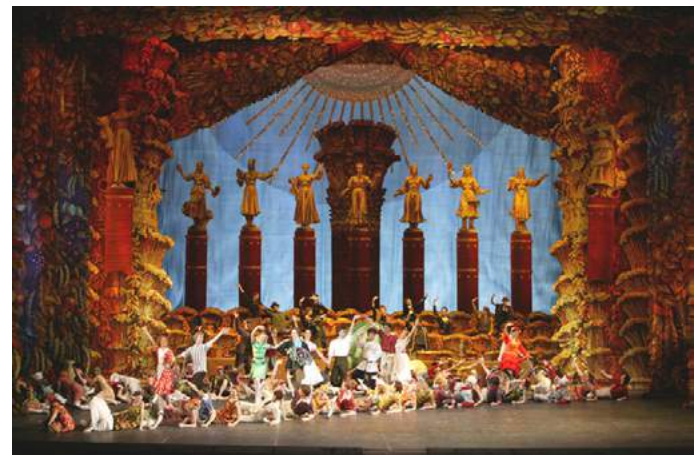
<u>The Bright Stream</u> at the New Stage on December 18 -20

December 23-26 – opera by Wolfgang Amadeus Mozart Le Nozze di Figaro. Libretto by Lorenzo Da Ponte after the play by Pierre de Beaumarchais. The première took place on April 25, 2015.