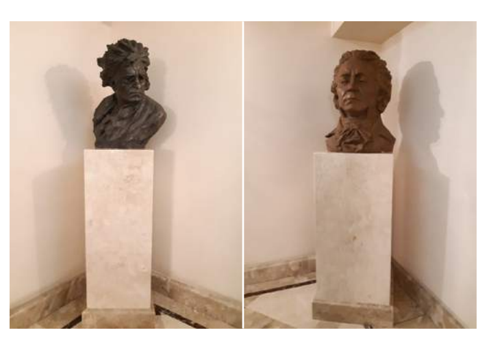
The composer's busts at the Bolshoi Beethoven Hall.

Since 1921 the Beethoven Hall hosted concerts of the Bolshoi chamber companies, outstanding national and foreign musicians performed there. Since 1966, meetings with writers, poets and actors of other theatres and foreign artists were held there, and in 1978 vocal and instrumental concerts resumed there. In the 1960s a portrait of Beethoven was commissioned from Moscow sculptor Pyotr Shapiro to grace the Beethoven Hall which was housed in the Bolshoi Imperial Foyer before reconstruction. Nowadays you can see this bust of the composer in the foyer of the new housing of Beethoven Hall where it was moved after the theatre reconstruction and restoration (2005-11.)