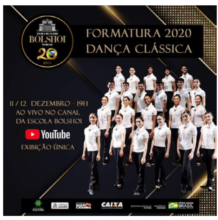
The Bolshoi Ballet School in Brazil graduation ceremony for the first time on <u>YouTube</u>

The Bolshoi Ballet School in Brazil, the first and only one outside Russia, started its work on March 15, 2000 in Joinville, Santa Catharina. The school' method and system of training corresponds that of the Russian choreographic school.