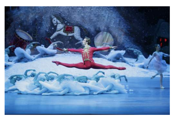
The Bolshoi Ballet principal Semyon Chudin as Prince-Nutcracker – a shot from the screening of The Nutcracker by the Bolshoi.