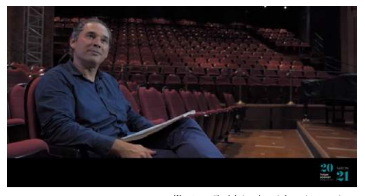
Tugan Sokhiev's video interview on the French online publication <u>Culture 31</u>

\underline{\operatorname{Link}} to the article and the video interview with Tugan Sokhiev