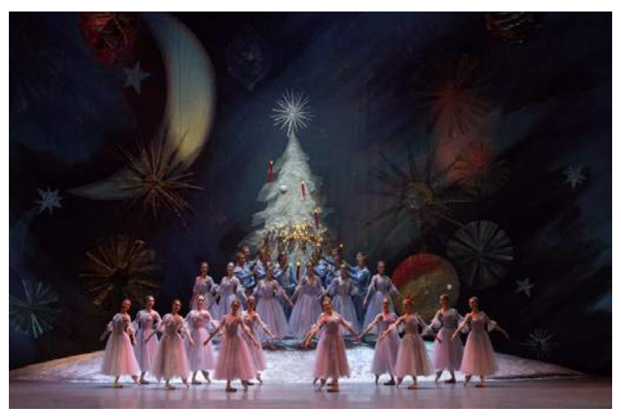
The Bolshoi Ballet's Nutcracker, a livestream recording from Moscow / Avont Theatre

<u>CA Noticias</u> (Portugal): "The Nutcracker – Bolshoi, full of magic and fantasy — on December 22 in cinemas of Portu and Lisbon."