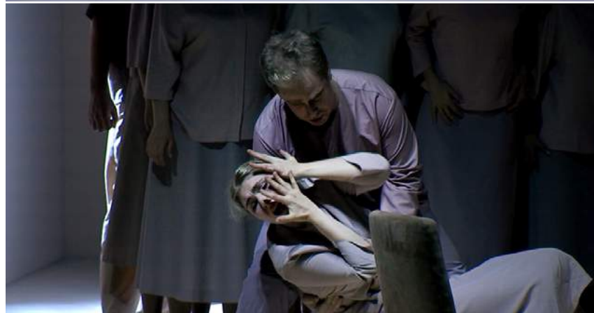
On December 10 the Bolshoi Theatre presented the opera Les pêcheurs de perles by Georges Bizet at the Chamber Stage