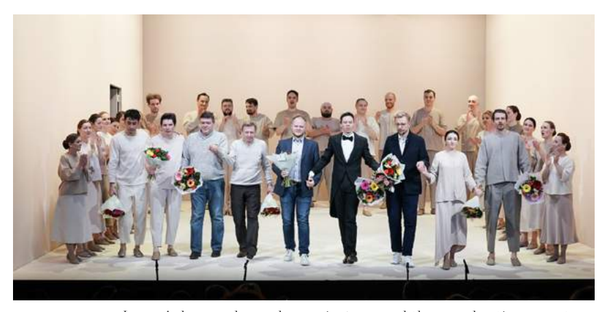
Les pêcheurs de perles – singers and the production creators at curtain calls.