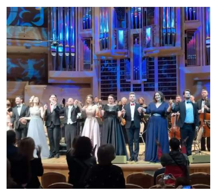
Members of the Young Artists Opera Program and conductor Alexander Soloviev at curtain calls after their performance at Svetlanov Hall of MIHM on December 13.

A video fragment of the curtain calls <u>Programme</u>