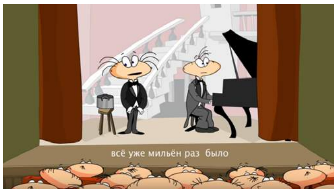
Oleg Kuvaev's Malenkaya pesenka has become popular on the web again