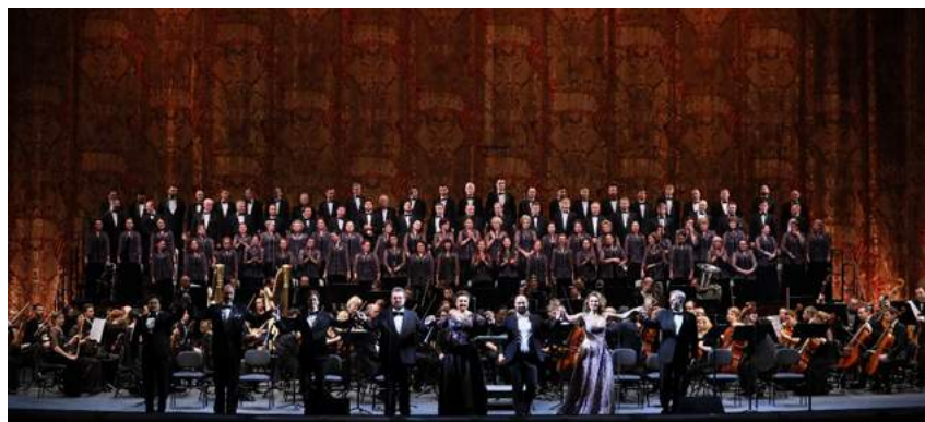
The Bolshoi presented the concert version of Mazeppa by Tchaikovsky at the Historic Stage on March 7 and 8.

March 7-9, the Chamber Stage — the premiere of the new staging of the children's opera The Little Sweep by Benjamin Britten Libretto by Eric Crozier.