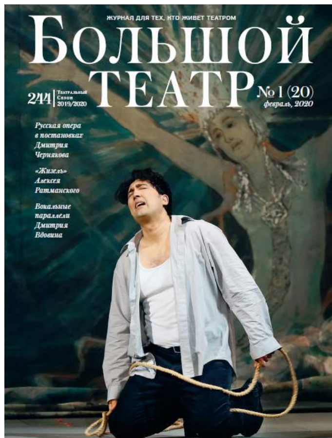
Bolshoi Theatre 2020. Ed 1 (*.pdf)

The first 2020 edition of Bolshoi Theatre magazine , dedicated to recent premieres — Giselle, Dido and Aeneas, Sadko, The YOP 10th anniversary — and other upcoming ones.