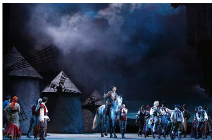
March 10 and 11 - Don Quixote at the Historic Stage.

March 13, the Historic Stage — the opera Attila (1846) by Giuseppe Verdi, Bashkir State Opera and Ballet Theatre production — the directorial debut of Grammy and Golden Mask winner, opera singer Ildar Abdrazakov.