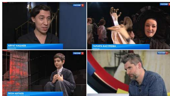
The Little Sweep at the Bolshoi