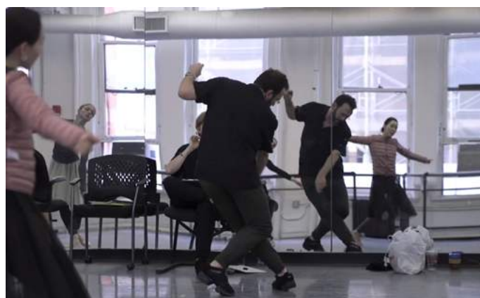
A YouTube video with Alexei Ratmanský — for the premiere Of Love and Rage in ABT (March 5-8)

DE publishes brief news about Alexei Ratmanský’s new ballet Of Love and Rage for American Ballet Theatre, which premiered at the Segerstrom Centre for the Arts in California from 5-8 March. The ballet is set to music by Aram Khachaturian with arrangements by Philip Feeney.