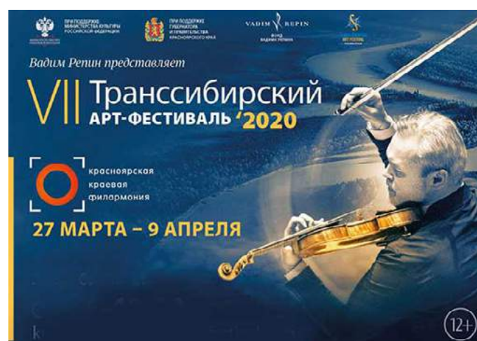
The 7th Trans-Siberian Festival will run on from March 27 until April 9 2020