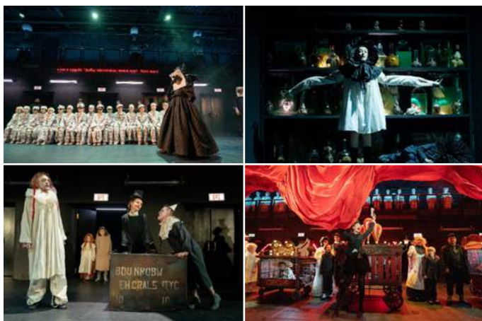
Photo from the premiere