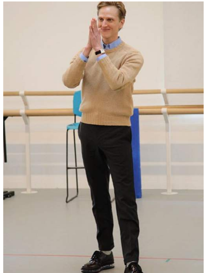
David Hallberg at the meeting with the Australian Ballet on March 5. The dancer's photo on Instagram

The English language Moscow based daily online news publication Moscow Times publishes an article titled "Planning Your Visit To Bolshoi Theatre. When living in Moscow, this is a must go. At least one time. The building is an incredible beauty in itself and has a unique grandeur. And the performances are at the top of world-class. Do not let high prices and the necessity to buy tickets long in advance scare you. Your experience will be worth it!" The article includes several large photos of the Bolshoi Theatre.