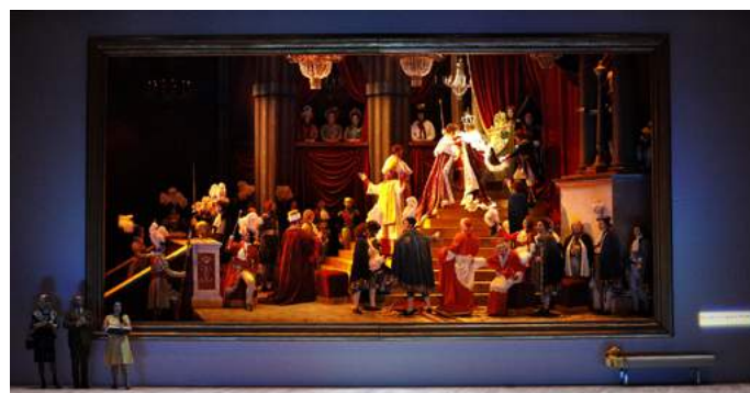
Il Viaggio A Reims by Gioacchino Rossini at the Historic Stage — March 3-6.

March 3, 4, 5, 6, the Historic Stage — Il Viaggio A Reims by Gioacchino Rossini.