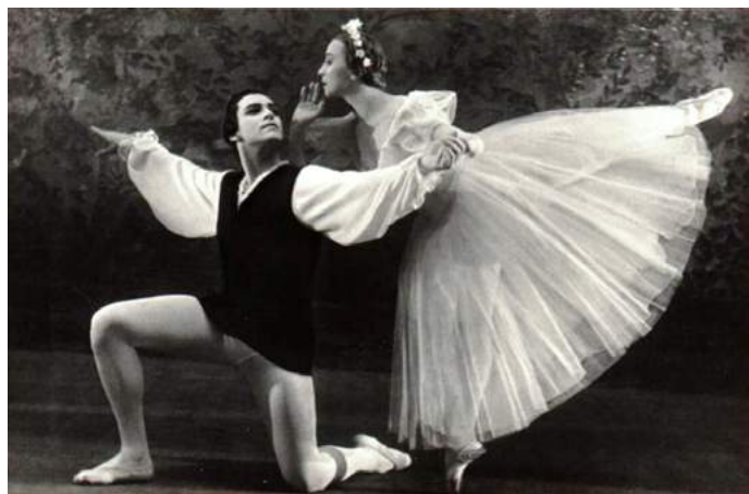
Nikolai Fadeyev and Galina Ulanova in Les Sylphides ballet (postcard of 1962)

On March 27, the International Theatre Day, the Bolshoi will host the traditional awards ceremony of the Golden Mask special prize — For Outstanding Contributions to Development of Theatre Art.