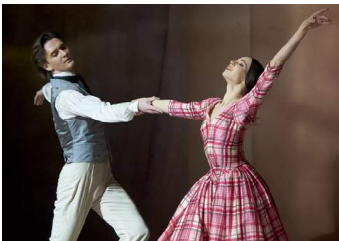
Diana Vishneva and Vladislav Lantratov in the duet from Alexei Ratmanský's Utracheniy Illusii

The first evening's programme also included one-act ballets Concerto DSCH and Lunnii Piero with an updated cast as well as fragments from the ballets Cinderella and Konek-gorbunok . Reports Muzikalniy Klondaik , Kultura Channel , Sankt-Peterburg Channel and more than 10 other media.