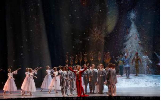
Semyon Chudin in ballet <u>Nutcracker</u> - there was a screening of the ballet in local cinemas on December 15, 2019.

The on-line specialised entertainment news publication Broadway World reports: "The Bolshoi Ballet's magical Nutcracker production captivates audiences of all ages and brings them on a whirlwind journey of enchantment with rising star soloist Margarita Shrayner perfectly embodying Marie's innocence and joy along with the supremely elegant principal dancer Semyon Chudin as her <a href="Nutcracker Prince">Nutcracker Prince</a>.".