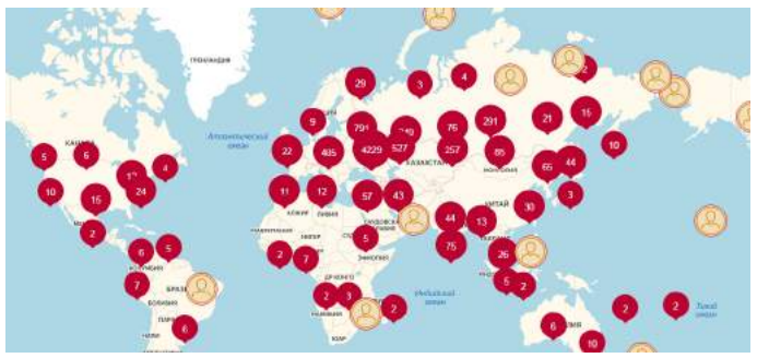
Members of the project Open the Bolshoi History on the world map

The project <u>Open the Bolshoi History</u> in Russia-24 <u>report</u> about the International Volunteers' Day.