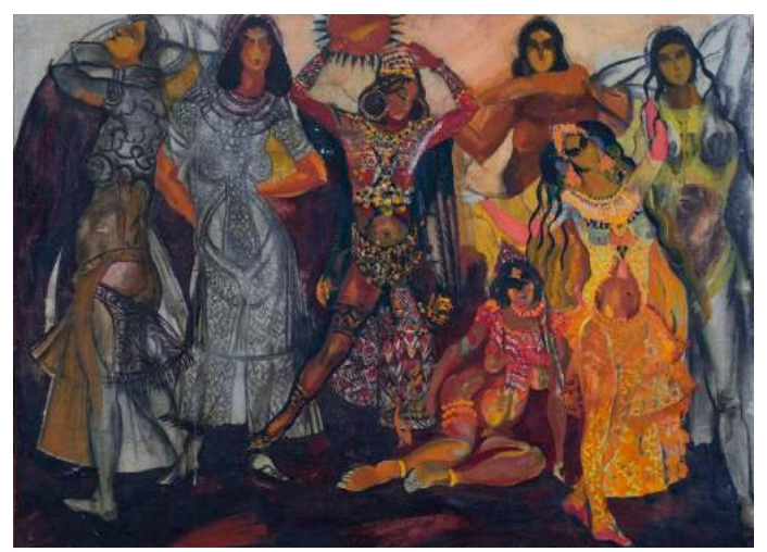
Costume draft by Fyodor Fedorovsky Polovtsian Women for the opera Prince Igor by Alexander Borodin. 1934.

December 20, the exhibition The Legends of the Bolshoi opened within the project The Bolshoi to the Cities of Russia in Kaliningrad Regional Museum of Visual Arts. Kaliningrad is a special point on the map of Russia, in the end of 2023 a branch of the Bolshoi will open there.