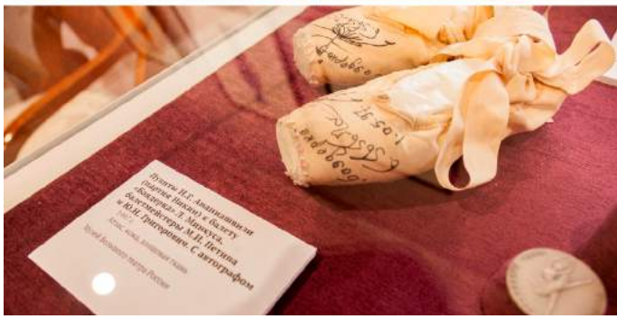
The exhibition Theatre Fairytale

The Bolshoi Theatre Museum has loaned the project more than 50 items - sketches and costumes of "fairytale" productions of the Bolshoi from various years.