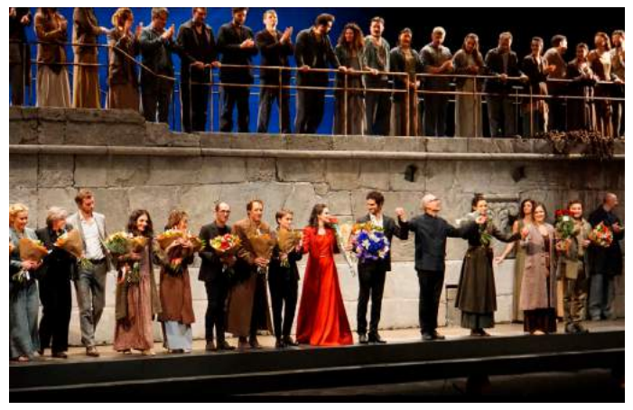
Curtain calls after the premiere on December 5.