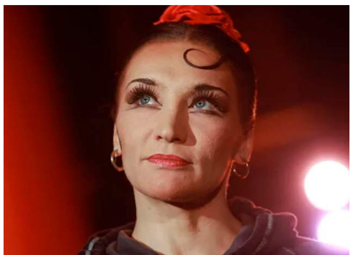
Nadezhda Gracheva

December 21 — Bolshoi ballet master, Bolshoi ballet dancer 1988-2011, National Artist of Russia, Nadezhda Gracheva - anniversary.