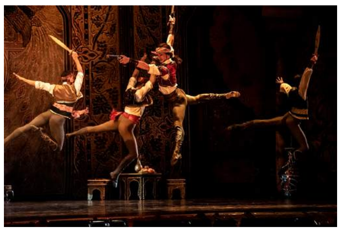
The premiere run of the ballet Le Corsaire was shown in the Pushkin's Nizhny Novgorod State Academic Theatre of Opera and Ballet.

In January 2020 in Moscow begins the <u>26th Festival Golden Mask</u>. Journal Company: