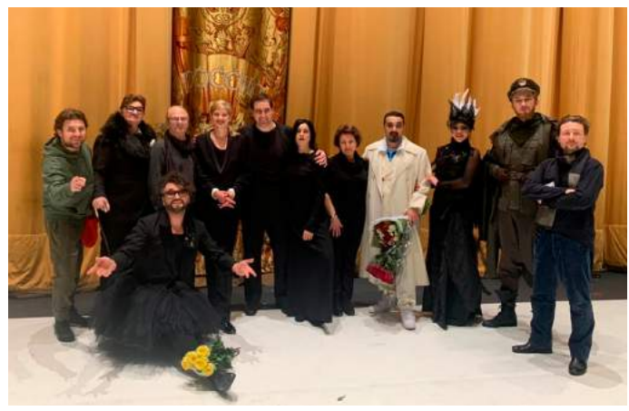
Singers after the performance of <u>Manon Lescaut</u> on December 11, the Historic Stage.

Curtain calls video after the performance of \underline{\text{December 11 on FB}}.