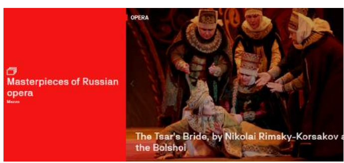
December 21 (12:30 MSC, 10:30 UTC+02:00) - screening of the opera <u>The Tsar's Bride</u> by Nikolai Rimsky-Korsakov

On December 25 the Bolshoi Historic Stage starts its traditional series of The Nutcracker performances. Music by Pyotr Tchaikovsky, choreographic version by Yuri Grigorovich.