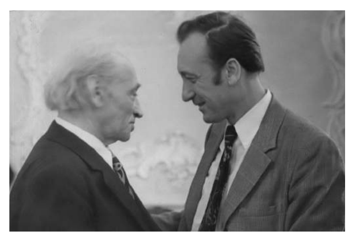
Rodion Schedrin and Yehudi Menuhin, 1979.

December 21 — Bolshoi ballet master, Bolshoi ballet dancer 1988-2011, National Artist of Russia, Nadezhda Gracheva - anniversary.