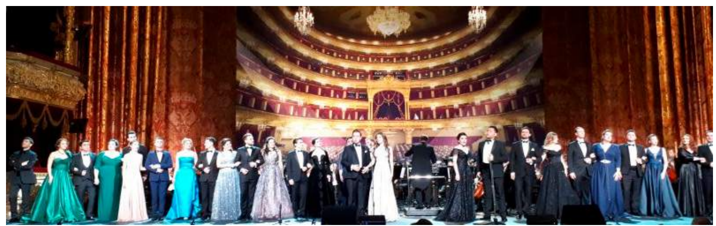
A gala of the Bolshoi YOP members and graduates 10 Years of the Bolshoi Theatre Youth Opera Program