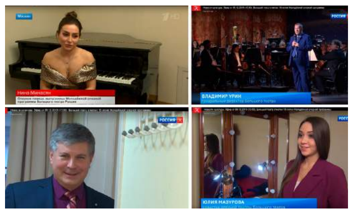
Reports about the Bolshoi YOP on the <u>First Channel</u> и <u>«России-К»</u>