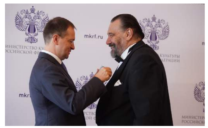
\label{eq:Minister} \begin{array}{l} \mbox{Minister of Culture Vladimir Medinsky and Vladimir Matorin.} \\ \mbox{Photo} \ / \ \underline{\mbox{the Ministry press-office}} \end{array}

The order For Merit to the Fatherland, 4th rank, was given to the Bolshoi Ballet prima Svetlana Zakharova.