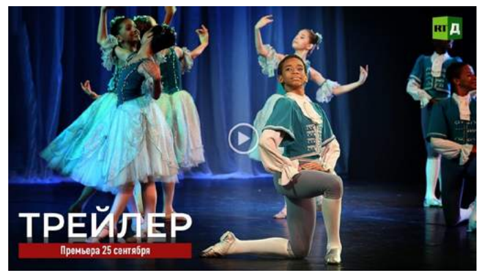
The trailer of Bolshoi: Pas-de-Brazil is available on <u>YouTube</u>