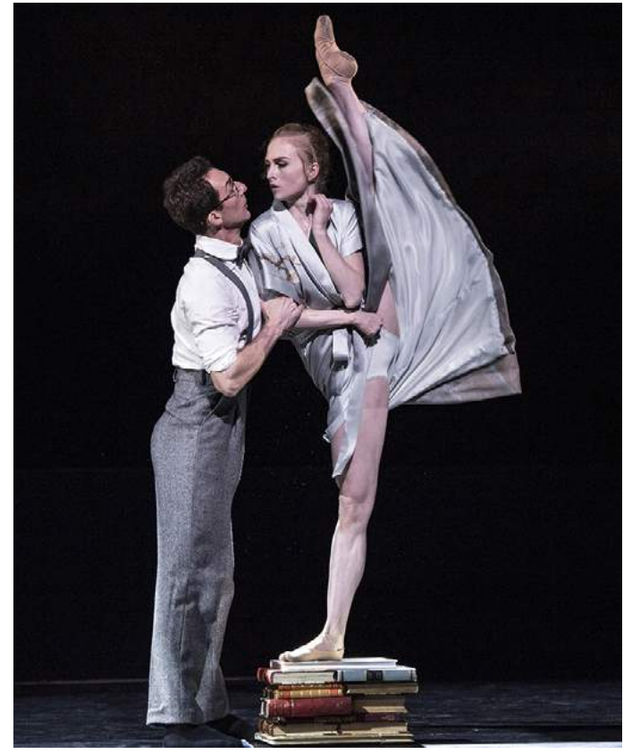
<u>Hedda Gabler</u> by Norwegian National Ballet.

The ballet Hedda Gabler at Operahuset website