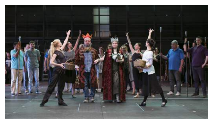
The rehearsal of The Tale Of Tsar Saltan opera.

September 26, the New Stage – the first opera premiere of the 244th season, in honour of 175 anniversary of the birth of Nikolai Rimsky-Korsakov and the 220th anniversary of the birth of Alexander Pushkin – <u>The Tale Of Tsar Saltan</u>, libretto by Vladimir Belsky after Alexander Pushkin's tale of the same name. Also on September 27, 28 (12:00 and 19:00), 29 (14:00).