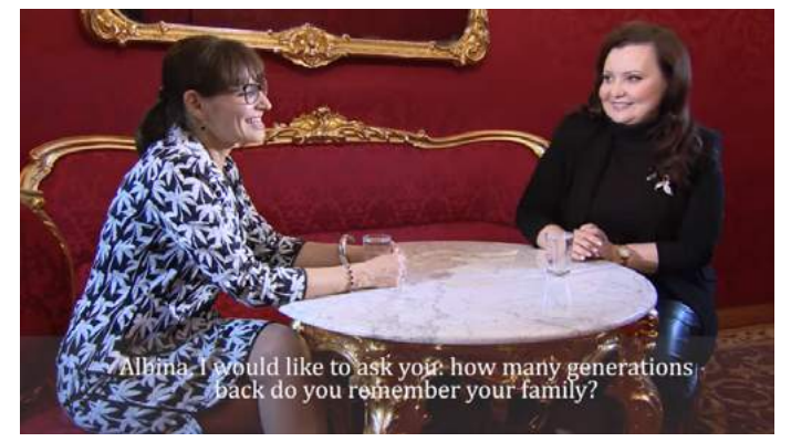
Albina Shagirmuratova – the guest of the <u>Green Salon</u> of the Bolshoi