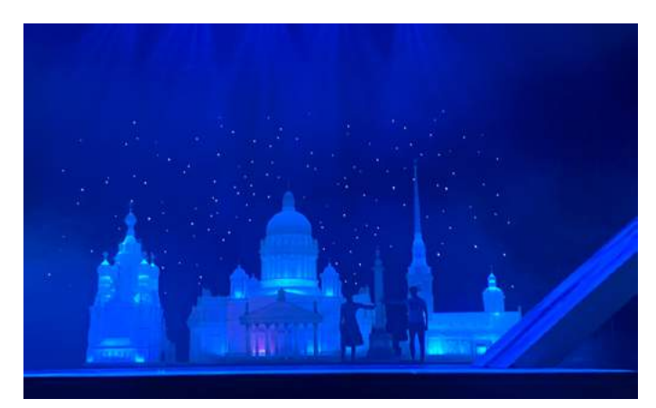
The Tale of Tsar Saltan, premiere on September 26.

"It is a very important fact that this season brings two operas by Rimsky-Korsakov – The Tale of Tsar Saltan and the epic Sadko – in a row. We added Mazepa for a reason, too, in a concert version. It is maybe one of the best and most well known scores by Tchaikovsky," the chief conductor and music director of the Bolshoi Tugan Sokhiev said.