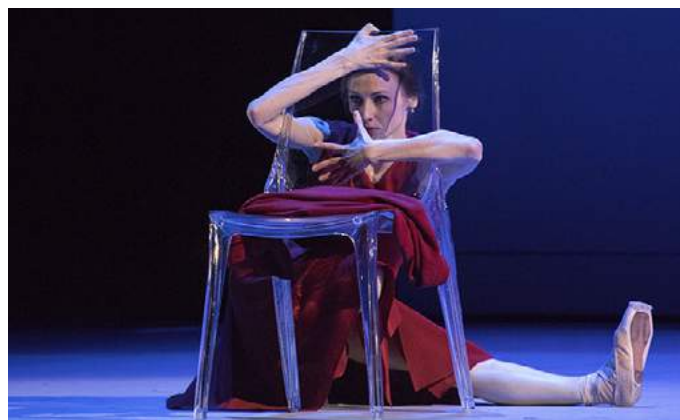
Svetlana Zakharova as Anna Karenina.