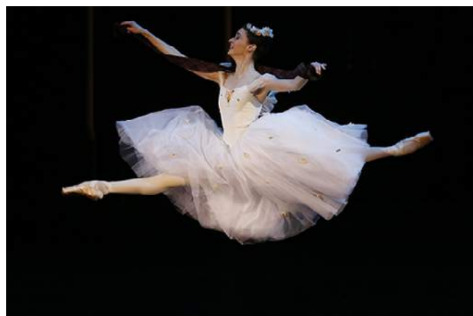
April 23, 24 and 25 at the New Stage – La Sylphide.

Renowned Danish dancer and choreographer Johan Kobborg staged this romantic ballet by August Bournonville at the Bolshoi.