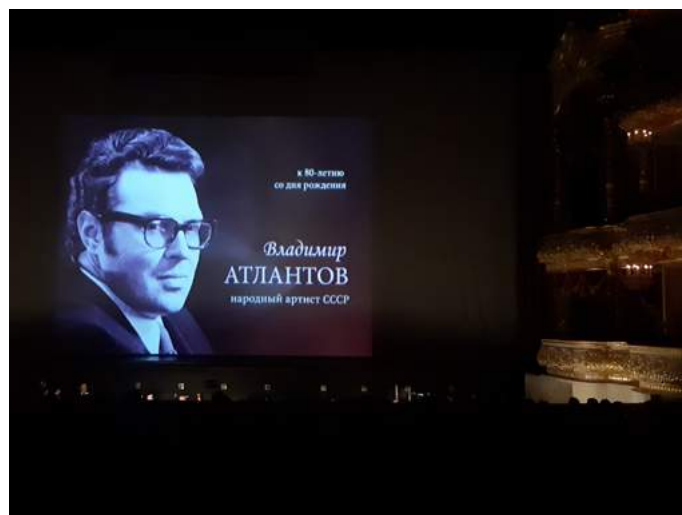
La Traviata performance of April 20 was dedicated to National Artist of the USSR Valdimir Atlantov

Atlantov's family including his grandson Mikhail attended the performance.