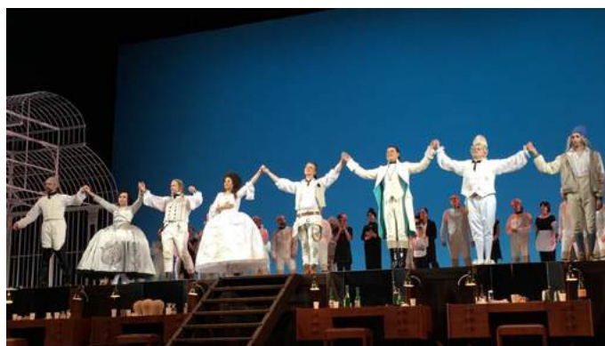
Curtain calls after the performance of Il Barbiere di Siviglia on April 10.

April 16, 17 and 18 at the New Stage — Sergei Prokofiev's Romeo and Juliet in choreographic version by Alexei Ratmansky.