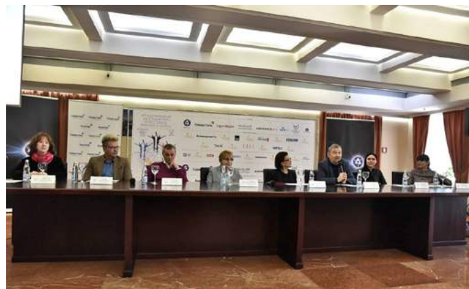
April 11, the Bolshoi Theatre press centre

On April 11, the Bolshoi Theatre hosted a press conference for the XXVII Benois de la Dansé International Ballet Prize , where the organisers spoke in detail about the gala concert programme and announced the nominees. The permanent chairman of the jury is Yuri Grigorovich.