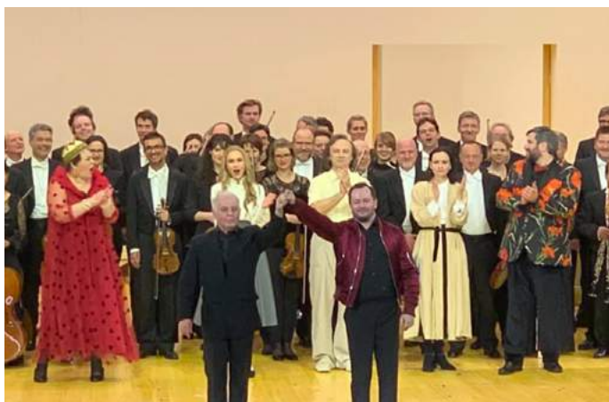
The premiere of The Betrothal in a Monastery at the Staatsoper in Berlin, April 13.