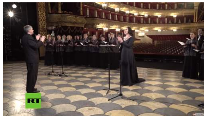
The video published by the news agency Russia Today