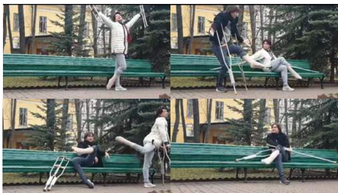
From the Life of Vacationers on the Instagram by Maria Alexandrova

Pas de deux From the Life of Vacationers is published on the Instagram by Maria Alexandrova, who is undergoing rehabilitation after a professional injury, as Vladislav Lantratov is, too. The humour of this “comic dumb” scene is still sad, though life-giving. All the visitors to their pages on social media wish the favourite artists the quickest recovery.