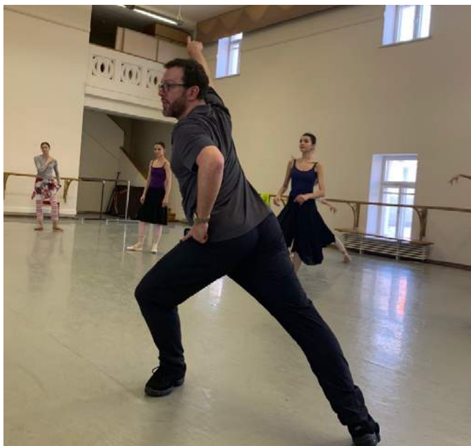
Alexei Ratmanský was in Moscow for the rehearsals with the artists of the Bolshoi.

April 20 (12:00 and 19:00) and 21 at the New Stage — Boris Asafiev's ballet The Flames of Paris in choreographic version by Alexei Ratmanský with use of the original choreography by Vasily Vainonen.