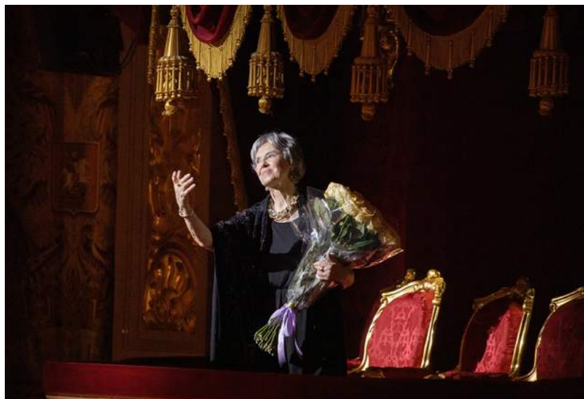
The heroine of the festivities, National Artist of the USSR Marina Kondratieva.

The singer talks about himself in the film Two Lives on Kultura channel