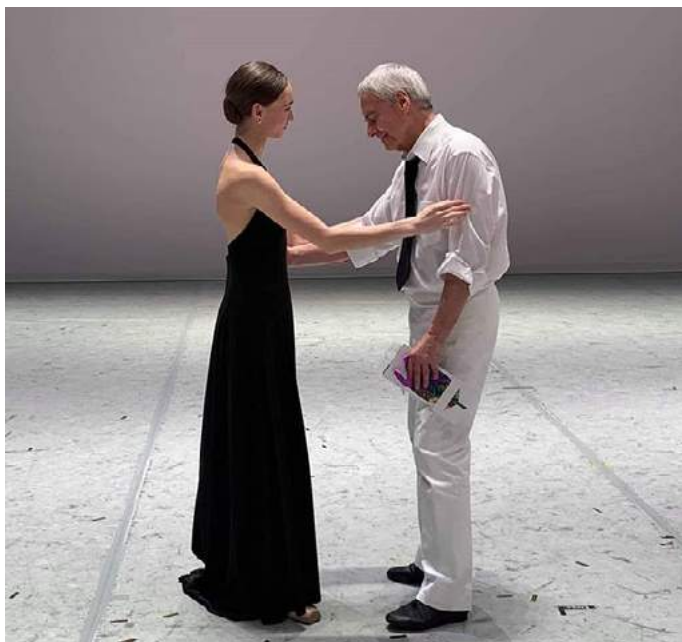
Olga Smirnova on Instagram on February 24: “How to touch something Timeless — John Neumeier’s artistic genius is stunningly true and profoundly touching!”