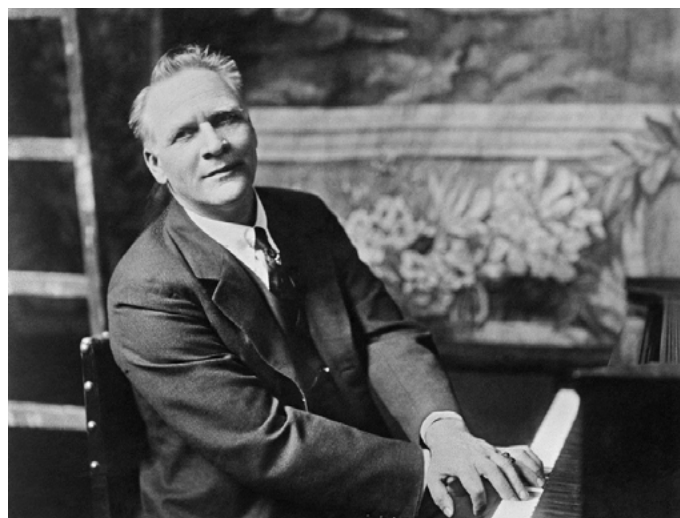
Fyodor Chaliapin (1873–1938)

February 13 — famous Russian singer (bass) Fyodor Chaliapin (1873–1938)