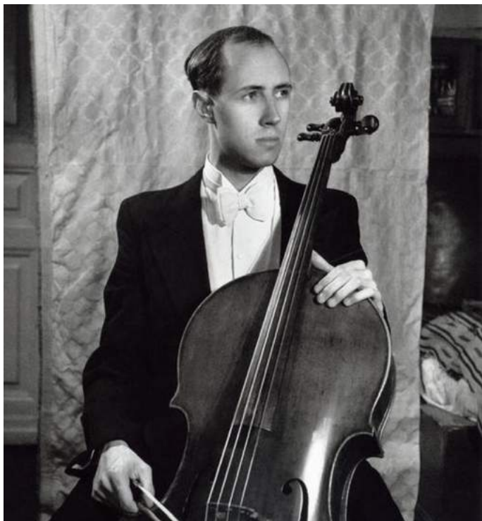
First Channel on February 27 (00:00) showed a documentary about Mstislav Rostropovich. Photo of 1948

The First Channel on February 27 (00:00) a documentary about Mstislav Rostropovich Just Slava (Russia, 2019; producer Svetlana Turner).