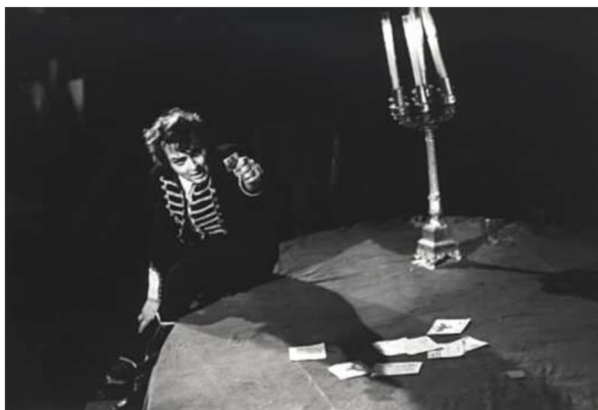
Vladimir Atlantov as Hermann, the Queen of Spades by Tchaikovsky.