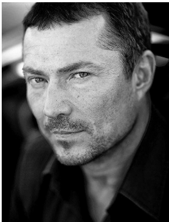
Andrejs Žagars, October 16, 1958 – February 26, 2019

Tragic news came from Latvia on February 26. Andrejs Žagars has passed away.