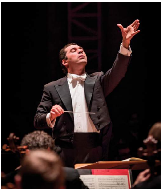
March 13–17 – the Bolshoi Choir, Opera and Orchestra French tour will be in France