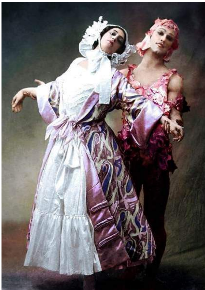
Tamara Karsavina and Vaslav Nijinsky in ballet Le Spectre de la Rose

March 9 — Tamara Karsavina (1885–1978), ballerina, danced at Mariinsky Theatre (1904–1918), since 1909 worked with Diaghilev's Ballets Russes. Performed together with Vaslav Nijinsky.