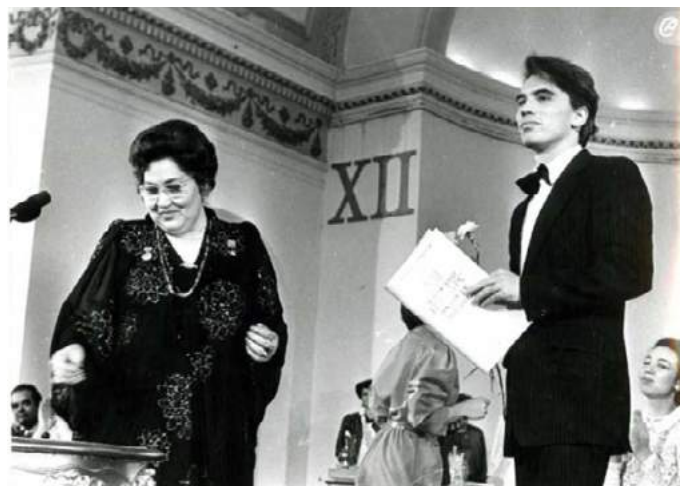
Irina Arkhipova and Dmitry Khvorostovsky, the 12th International Glinka Vocal Competition in Baku, 1987.

The 26th International Glinka Vocal Competition