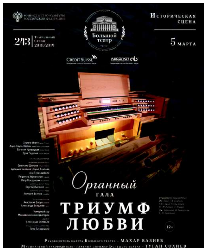
The Triumph of Love at the Historic Stage on March 5

The programme includes virtuoso toccatas by Bach, Widor, Duruflé, lyrical arias and duets by Saint-Saëns, Offenbach, Webber, as well as ballet miniatures, recitation to music, choir tutti.