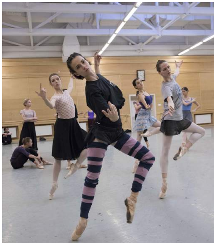
A rehearsal of The Winter's Tale in choreography by Christopher Wheeldon.