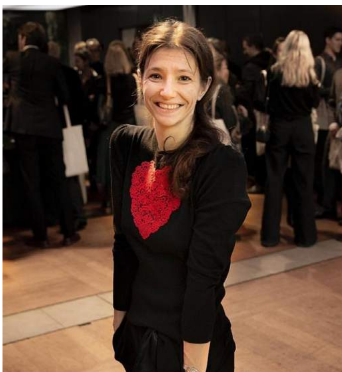
Alina Cojocaru — Best Female Classical Dancer (The Sleeping Beauty by Royal Ballet Covent Garden) at the National Dance Awards in London 2018, February 18.