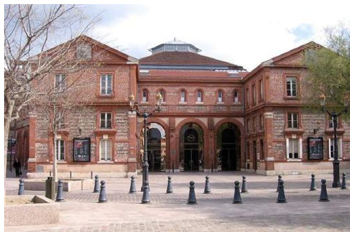
Halle Aux Grains in Toulouse.

Russian and foreign media cover the opening of the musical festival in Toulouse by chief conductor of the Bolshoi Tugan Sokhiev. The Bolshoi Orchestra and Choir are special guests of the festival this year.