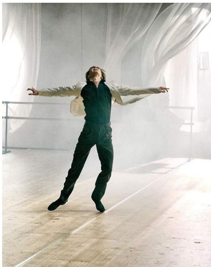
Nureyev at the Historic Stage on February 27 and 28.

On February 27-28 at the Historic Stage the ballet Nureyev by Ilya Demutsky and Yuri Possokhov was presented. The concept, direction and staging by Kirill Serebrennikov.