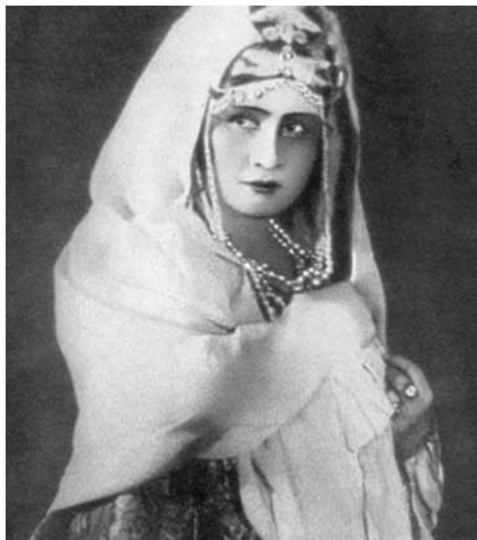
Nadezhda Obukhova as Lyubasha in The Tsar's Bride by Rimsky-Korsakov. 1933

March 6 — Nadezhda Obukhova, opera singer, National Artist of the USSR (1886–1961)