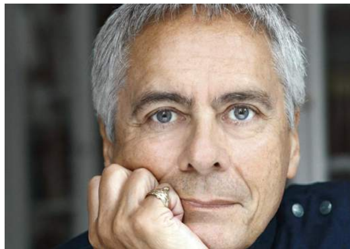
On February 24 choreographer John Neumeier celebrated his 80th birthday

February 24 — John Neumeier, choreographer, director of Hamburg Ballet — the 80th anniversary of his birth.