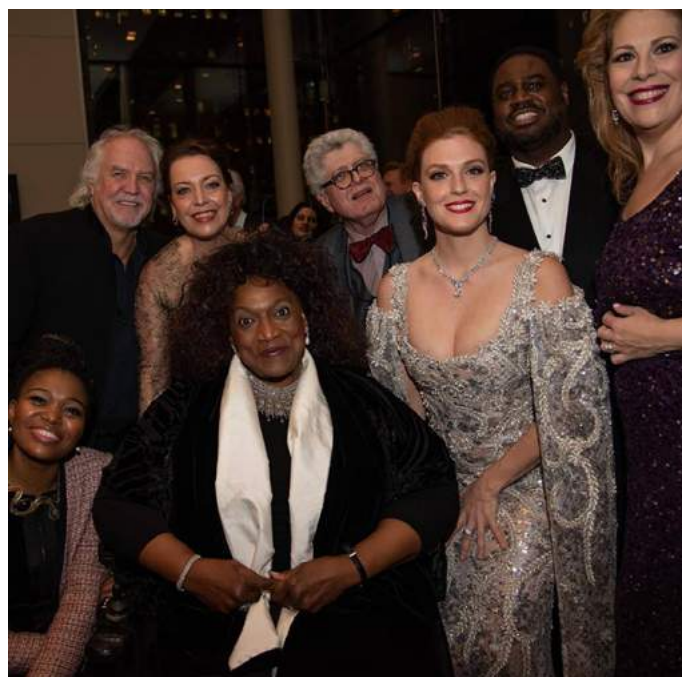
Jessie Norman was awarded the 12th Glenn Gould Prize for her outstanding contribution to the art of opera, Toronto, February 20.