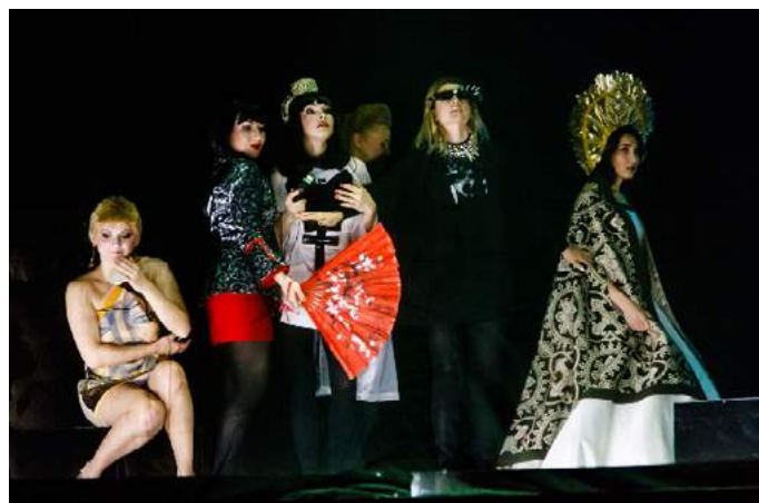
A scene from Stabat Mater.