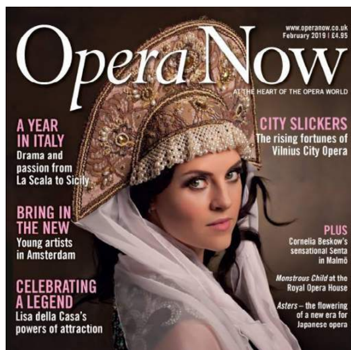
Venera Gimadieva on the cover of the Opera Now February 2019 issue.

Link to the video interview (34 minutes)