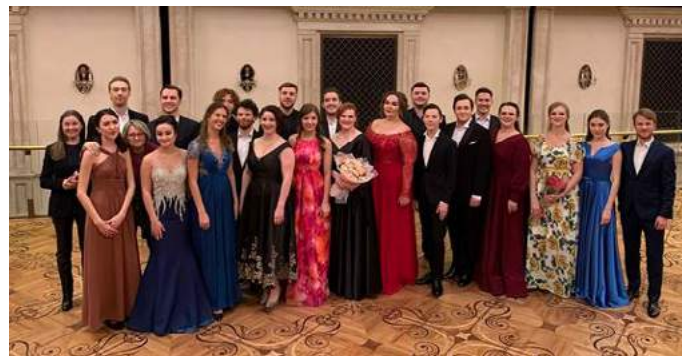
Artists of the Youth Opera programme of the Bolshoi Theatre and the Academy of the Paris National Opera after the concert.