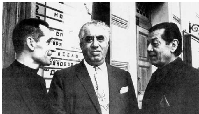
Grigorovich, Khachaturyan, Lifar.