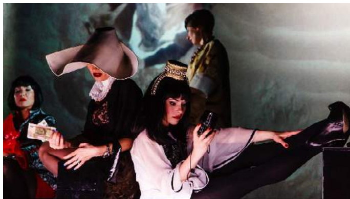
The stage version of Stabat Mater by Giovanni Battista Pergolesi on November 19 at the Chamber stage

See details at the Chamber Stage website