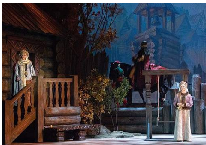
The Tsar's Bride by Nikolai Rimsky-Korsakov live on the Mezzo channel on November 15

Repeat screenings will also be available on December 6 (12:30 CET; Mezzo); December 8 (16:30 CET; Mezzo Live HD); December 9 (02:00 CET; Mezzo Live HD); December 11 (16:30 CET; Mezzo); December 12 (06:00 CET; Mezzo Live HD); December 13 (13:00 CET; Mezzo Live HD) and December 14 (22:20 CET; Mezzo Live HD)