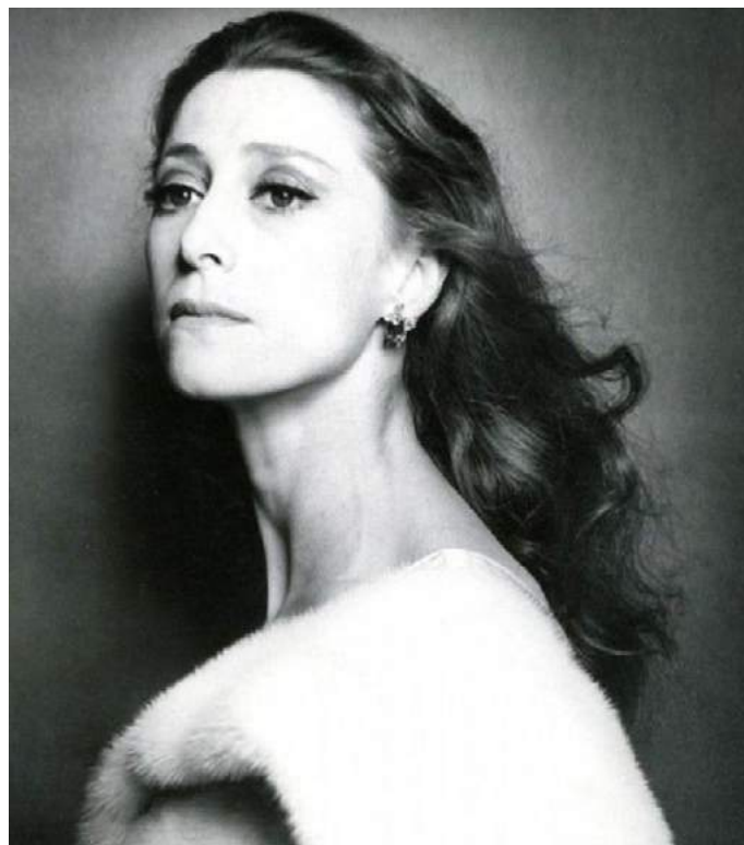
Maya Plisetskaya (1925-2015)

November 21 – Natalia Makarova, Merited Artist of the RSFSR (1969), soloist of the Leningrad Kirov Ballet