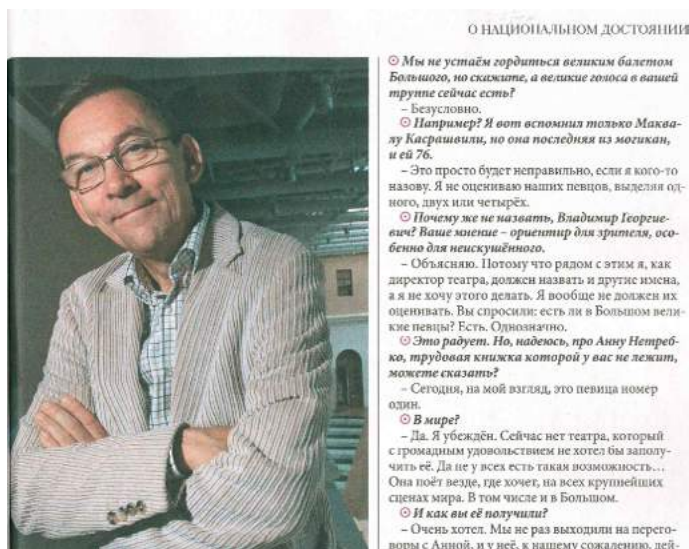
Interview of Vladimir Urin in STORY, December 2018

tass.ru tvkultura.ru regnum.ru vm.ru hellomagazine.com dni.ru