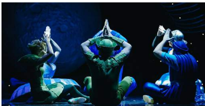
The Lunar World libretto by Carlo Goldoni at the Chamber stage on November 16 and 17

The two-act opera The Lunar World by Joseph Haydn, libretto by Carlo Goldoni, was performed on the Pokrovsky Chamber stage on November 16 and 17. The première took place on December 20, 2013. The Lunar World by Haydn has never been performed in Russia before. You can read about the production on the web-site of the Chamber stage .