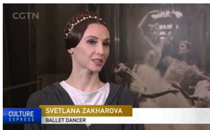
Svetlana Zakharova in CGTN TV report

The USA theatre news publication Playbill publishes a listing compiled by David Gewirtzman of The Opera And Ballet Fans’ Guide To Where They Can View Live Broadcasts. This includes a list of the Bolshoi Ballet broadcasts in cinemas for the upcoming season.