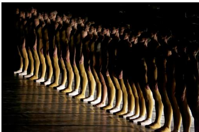
A scene from Artifact Suite .

ballet Petrushka only one act, with the choreography by Edward Clug. Artifact Suite , and Petrushka are at the Bolshoi in Moscow until this weekend.”