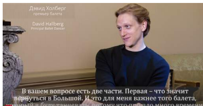
David Hallberg at the Green Salon of the Bolshoi Theatre