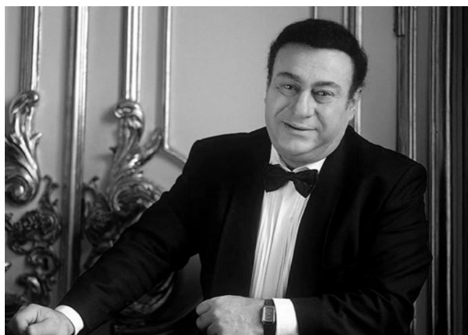
In memory of the National Artist of Russia Zurab Sotkilava (1937–2017) The Queen of Spades was performed on November 20