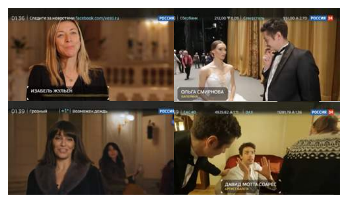
Industria Kino about La Bayadere screening/Rossia 24

Live screenings in the cinemas <u>Around the world</u> <u>The cinema season 2018/19 at the Bolshoi website</u>