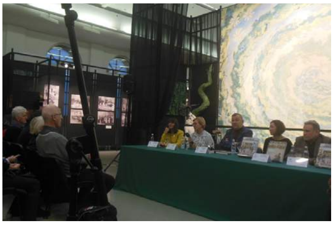
The book presentation at the New Manège, January 30.