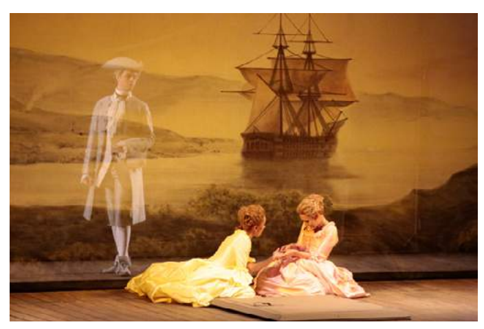
Così Fan Tutte, Ossia La Scuola Degli Amanti by Mozart at the New stage on February 6, 7, 8, 9, 10

January 22, Beethoven Hall — a concert of the Bolshoi Chamber Orchestra <u>Fêtes Galantes</u> (19:30)