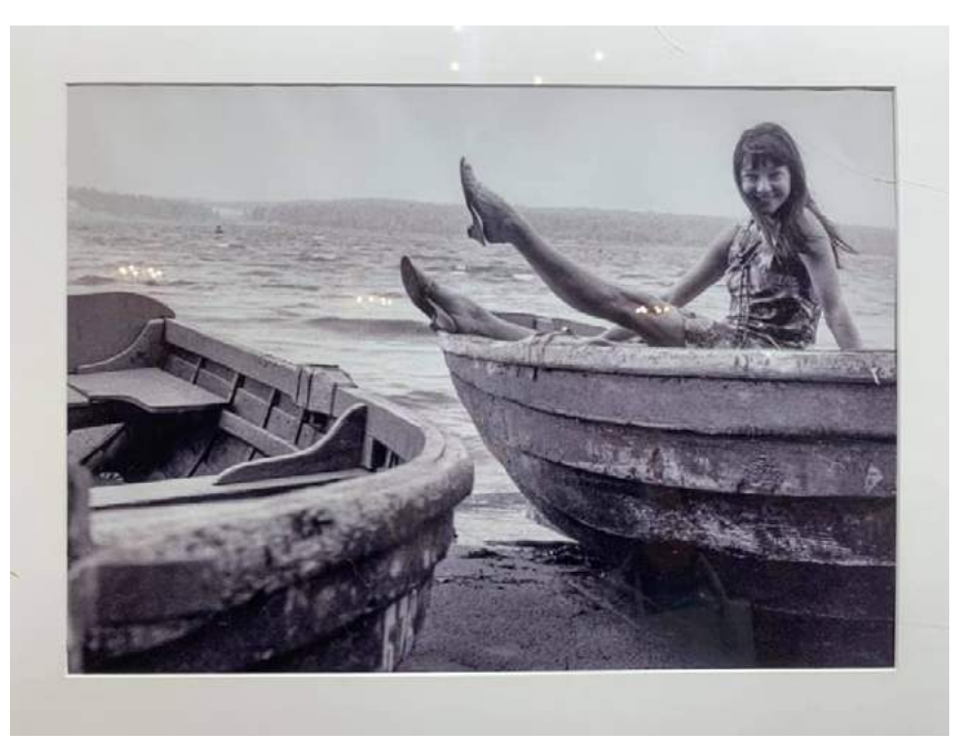
An exhibition from the Bolshoi Museum collection for Ekaterina Maximova's anniversary at the fover of the Historic Stage

On February 4 the Bolshoi Choir led by the chief conductor and music director of the Bolshoi Tugan Sokhiev performed at Tchaikovsky Concert Hall of the Moscow Philharmonic, The Bolshoi Orchestra, Tugan Sokhiev, Vasily Ladyuk. The programme included the Cantate Spring for baritone, choir and orchestra, Opus 20 by Sergei Rakhmaninov, the choreographic scene Polovtzian Dance from the opera Prince Igor by Borodin, Symphony #2 E-moll, op.27, by Rakhmaninov.