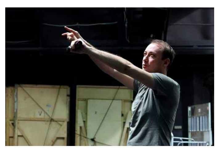
Timofei Kulyabin at the rehearsal of Rusalka.

For the Bolshoi Museum 100th anniversary the museum curators have prepared a unique book — the first detailed publication of the items from the Museum collection that dates back as far as the Petrovsky Theatre, i.e. to 1776, the official date of the Bolshoi's foundation. Most of the photos presented in the book have never been published before.