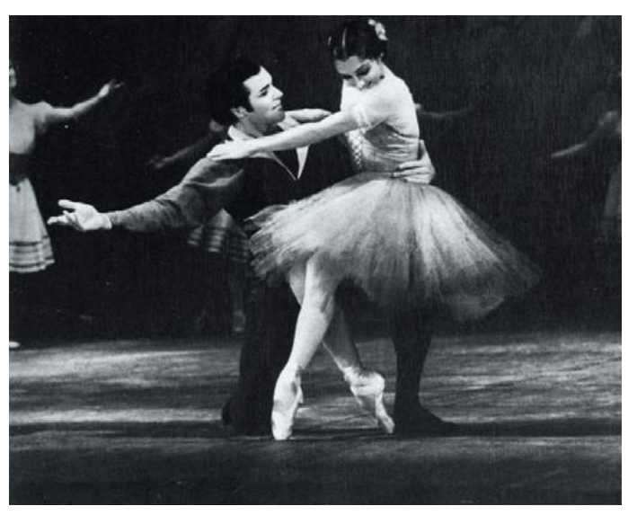
Ekaterina Maximova and Nikolai Fadeyechev in Giselle

January 27 — ballet master of the Bolshoi, National Artist of the USSR Nikolai Fadeyechev