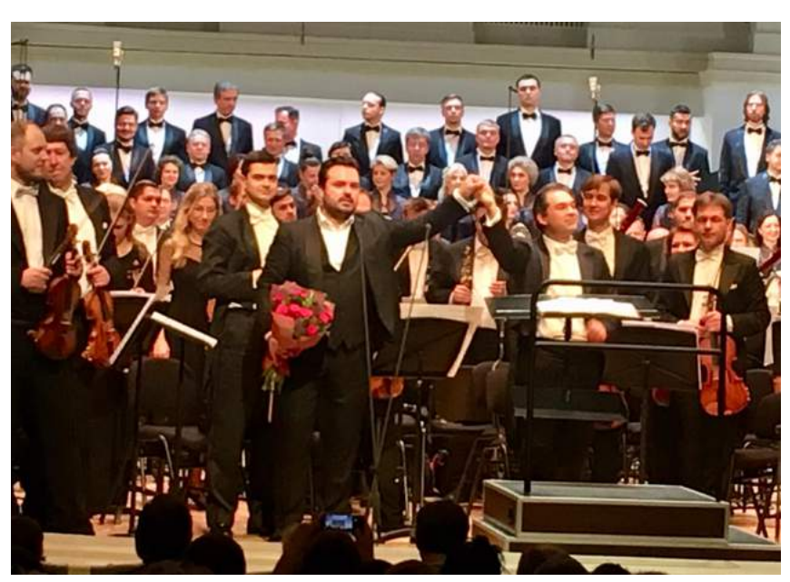
After the concert on February 4.