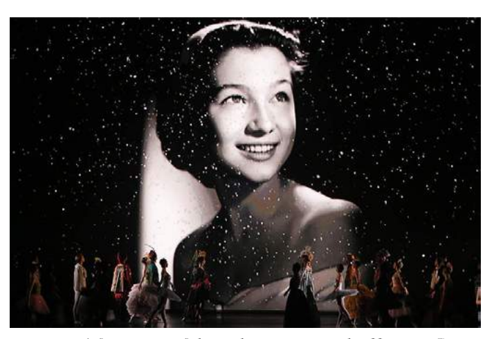
A fragment of the gala concert at the Historic Stage on February 1.

<u>RT in Russian</u>: A Ballerina Outruns Her Time <u>tass.ru</u>